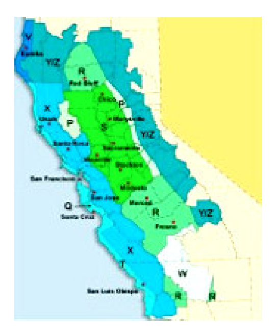
FIGURE 1 California Baseline Territories

As indicated in Figure 2 below, CARE rates stay constant at $0.09563/kWh for any consumption exceeding the baseline, while non-CARE rates continue to increase. Non-CARE rates rise rapidly once they reach Tier 3, which is priced at $0.25974/kWh and is more than 2.7 times higher than the CARE rates. The rate difference continues to grow, with non-CARE rates more than 4.6 times higher than CARE rates at Tier 5. As a result, residential bill savings associated with CARE participation become more significant as household energy consumption becomes higher.