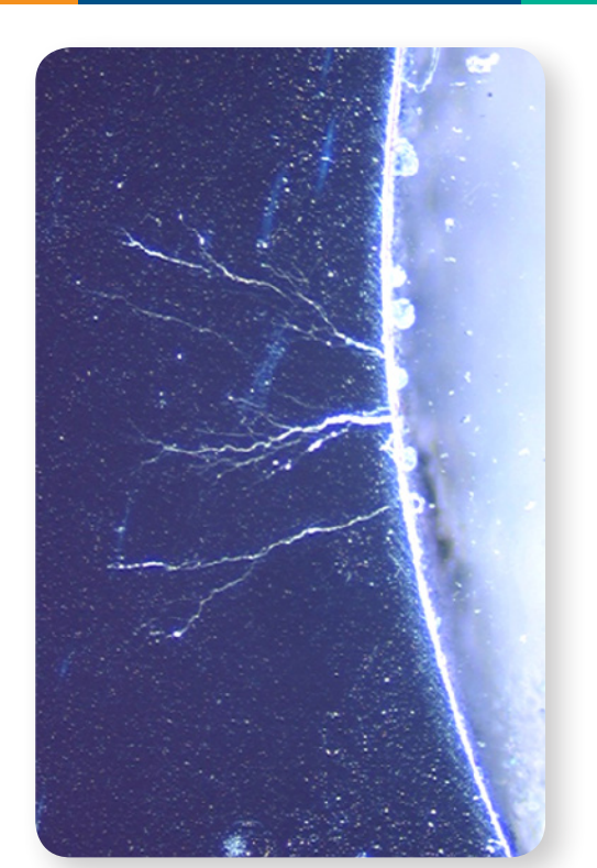
Cracking Thresholds are measured by exposing pre-cracked samples to tritium gas and slowly pulling them apart or by step-loading and holding until crack begins to grow. Crack growth is monitored by using the DC-Potential Drop technique.