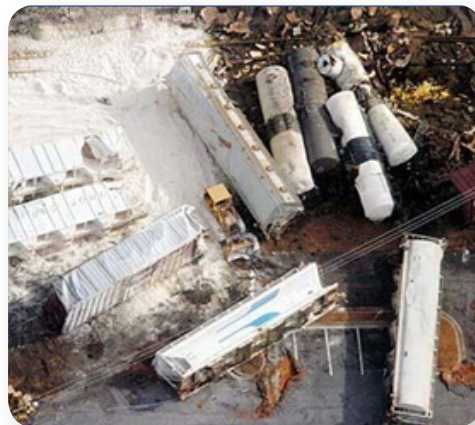
2005 Graniteville, S.C., train wreck that resulted in a major chlorine release

SRNL, in conjunction with the SRS Operations Center, has implemented a means for automated pager notifications to remote workers following receipt of National Weather Service severe weather warnings and lightning strikes. This automated system provides an additional 20 minutes of response time to a severe weather event. In addition, SRNL provides current weather observations and forecasts of general need to the SRS workforce through the SRS intranet (InSite).