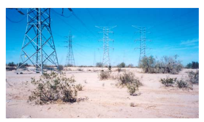
Electric transmission lines extend north from Mexico across the international border (which is the berm across the center of photo). Inside the U.S., the lines are constructed on BLM land.

Public scoping meetings were held in El Centro and Calexico, California, on November 20, 2003. About 10 stakeholders spoke at each – including area residents (U.S. and Mexico), a representative of the plaintiff, and elected officials and other representatives, including those from the cities, county, irrigation district, farm bureau, state government, and an environmental task force. Comments supported the agencies' preparation of an EIS and expressed concerns over air, water, and cumulative impacts issues. Several comments focused on the high incidence of asthma among local residents. Some commentors spoke in favor of the alternative technologies and mitigation measures.