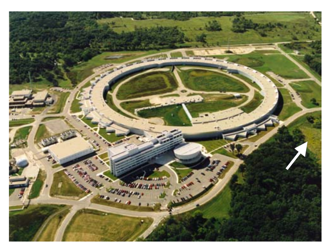
The Advanced Photon Source is a national synchrotron-radiation light source research facility funded by DOE's Office of Science. The restored wetland is the light area on the right edge of the photo (arrow), near the forested area and close to the site of the proposed new facility and an associated parking lot. The wetland is contiguous with diverse wooded and prairie areas and forms one of the largest expanses of high-quality habitat at the Argonne site.

In planning new construction, DOE's Chicago Operations Office (CH) incorporated measures identified in an environmental assessment (EA) process to protect a recently restored wetland. The EA for Enhanced Operations of the Advanced Photon Source at Argonne National Laboratory – East (DOE/EA-1455, June 2003) evaluated the impacts of constructing and operating a Center for Nanoscale Materials, a proposed new experimental facility that had potential for impacting the watershed of a nearby wetland.