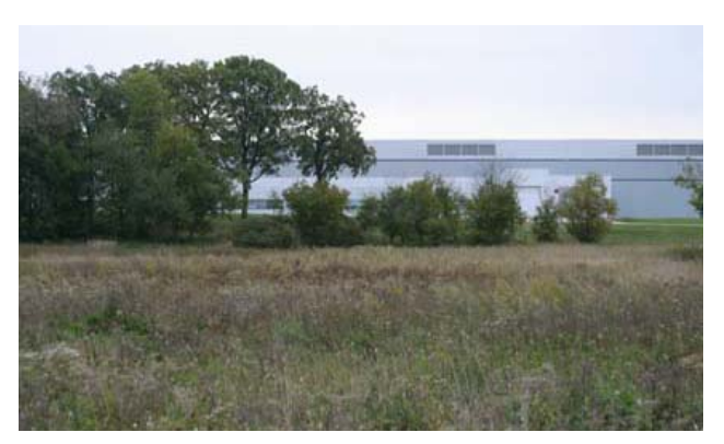
This wetland, adjacent to the Advanced Photon Source (background), was restored in less than two years by disabling a drainage tile network.

For additional information, contact Donna Green at donna.green@ch.doe.gov or 630-252-2264.