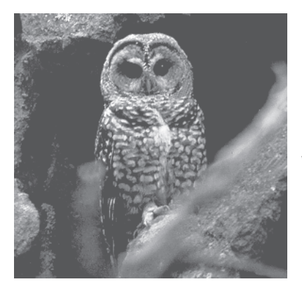
Mexican spotted owls are among the protected species at Los Alamos National Laboratory.