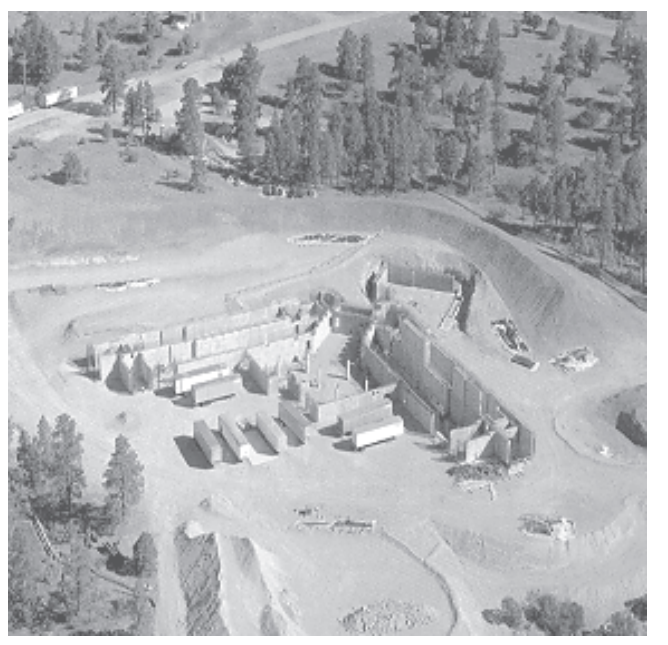
The nesting site (not shown) is at the edge of the Dual Axis Radiographic Hydrodynamic Test (DARHT) Facility.

Looking back over the DARHT project's history, we can discern many NEPA lessons learned. (See, for example, the case study on DARHT in the Lessons Learned Quarterly Report, December 1995, page 12, and the Legal Update in June 1996, page 8.) But while the DOE NEPA process for the DARHT facility EIS ended – at least in a technical sense - in January 1996 with the issuance of the Mitigation Action Plan. the environmental stewardship and efficiency initiated by this NEPA process continue.