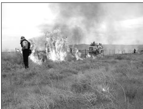
Controlled burn at Hanford.

In 2000, the Department experienced several large wildland fires that threatened the safety of personnel, facilities, and equipment at the Los Alamos National Laboratory (Los Alamos), the Hanford Site, and the Idaho National Laboratory. These fires burned over 212,000 acres of Department land, resulting in fire-related costs totaling almost $130 million at Los Alamos alone. An audit was initiated to determine whether the Department had taken action to identify possible hazards associated with wildland fires and mitigate the impacts of these fires. Our review revealed that all three sites had made a number of improvements in this area; however, essential wildland fire mitigation activities involving the assessment and removal of vegetation and the maintenance of roads had either not been performed or were not completely effective. (IG-0760)