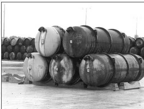
Depleted Uranium Hexafluoride cylinders at Portsmouth.

The OIG initiated an audit to determine if the Department had performed a cost-benefit analysis and implemented the most cost-effective approach to converting depleted uranium hexafluoride to a more stable form at the Portsmouth Gaseous Diffusion Plant. Our audit found that the Department performed a cost-benefit analysis in May 2005 which showed that adding an additional conversion line to the Portsmouth facility could save about $60 million. Yet, the Department had not taken steps to implement this cost-effective approach. We determined that, if