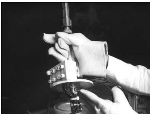
Checking a sample of thin film superconductivity material in liquid nitrogen.

The OIG initiated an audit to determine whether the Office of Electricity Delivery and Energy Reliability (OE) had effectively managed financial assistance provided to its Superconductivity Partnership projects. Our review revealed that while efforts were taken to address certain technical risks, the financial risks were not always addressed, and changes in market conditions were not always fully assessed. Of the 16 open Partnership projects reviewed during this audit, 5 were identified as needing stronger financial review.