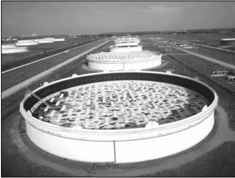
Holding tanks at the Strategic Petroleum Reserve.

The OIG conducted an audit to determine whether the Strategic Petroleum Reserve met its energy security mission in response to Hurricanes Katrina and Rita. We found that the Department used the Reserve and its assets with great effectiveness to address emergency energy needs in the crisis surrounding the hurricanes. The findings of our audit were generally positive. However, we found that while the alternate computer facility, located 55 miles northeast of the primary site, appeared acceptable under most circumstances, the far-reaching impact of Katrina proved that the proximity of the alternate site to the primary facility was less than optimal and affected the prompt restoration of computer network services vital to continuity of operations of the Reserve. Given the relative frequency of major hurricanes in the vicinity of the Reserve's primary facility, we concluded that management should consider moving the alternate site to a more remote location. (IG-0747)