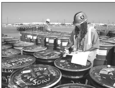
Retrieval of buried waste from low-level burial grounds at Hanford.

The OIG initiated an audit to determine if the Department had developed a comprehensive cleanup strategy for the remediation of the burial grounds storing nuclear waste at Hanford. Our audit found that the Department's remediation strategy: (1) may produce a waste form or waste package that, in some cases, will not meet the Department's current acceptance criteria for interim storage or disposal, and (2) did not reflect the cost to prepare the retrieved waste to meet waste acceptance criteria for storage or final disposal. As a result, the Department may incur