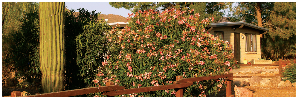
Smart landscaping can reduce your energy needs and save you money on heating and cooling bills.

Deciduous trees block the sun's heat in summer, but let sunlight pass through in the winter because they lose their leaves in autumn. Dense evergreen (coniferous) trees and shrubs provide year-round shade and can block strong winds.