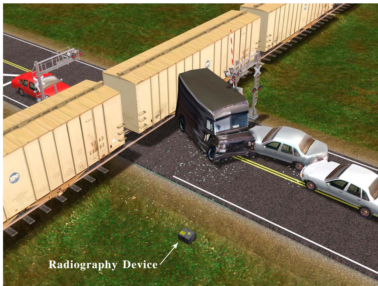
Figure 1: Suggested Site Layout

Controllers should only give the above radiological data to players if and when they use their survey equipment properly. For instance, if players do not turn their equipment on, or are not on the proper scale, controllers should indicate to them that their instruments are reading zero/off-scale as appropriate. Controllers should take note of whether players use their equipment properly (i.e., are instruments turned on and on the proper scale), but should not prompt them to do so.