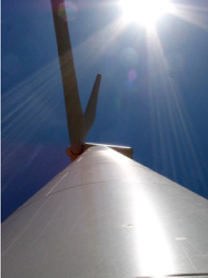
Schuff Steel will manufacture large-scale wind towers at its North Dakota plant

Energy Empowers is a U.S. Department of Energy clean energy information service. Our team produces stories featuring the people and businesses that are fueling the energy transformation and economic recovery in America. For more stories from your state, go to energyempowers.gov/NorthDakota