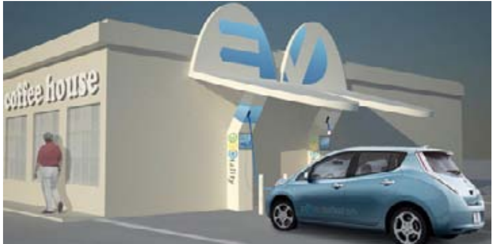
An artist's rendering of a Nissan LEAF charging outside a café.

Oregon has the most target cities participating in The EV