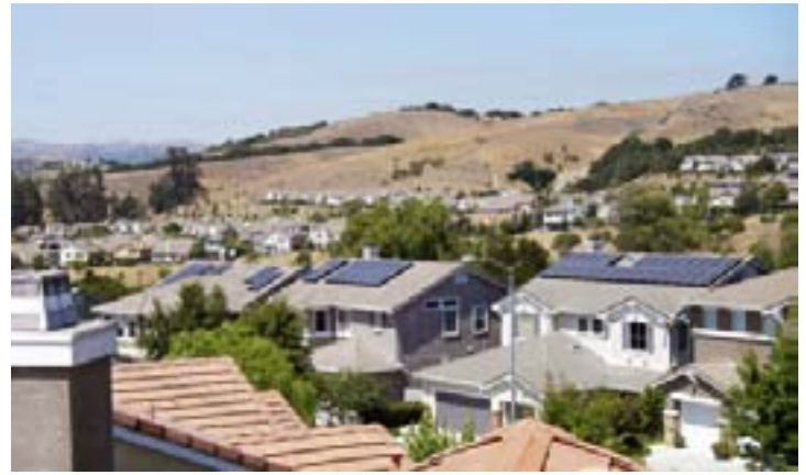
APS will install solar photovoltaic panels like these in Castro Valley, Calif. for a pilot project studying distributed energy in Flagstaff, Ariz.

Meanwhile, in return for hosting the solar panels, building owners are guaranteed the same rate for use of that solar electricity for the next 20 years. Locking in the solar energy rate not only guarantees