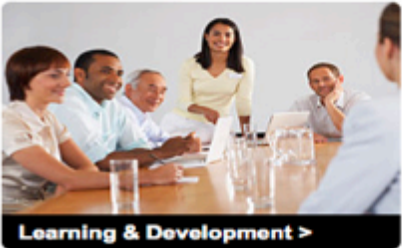
Learning & Development >