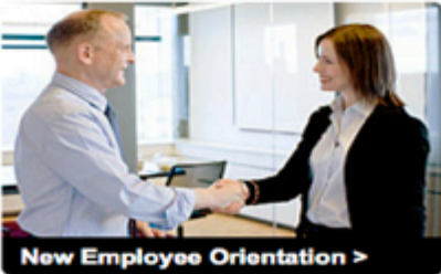
New Employee Orientation >