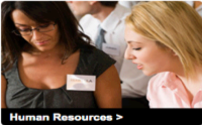
Human Resources >