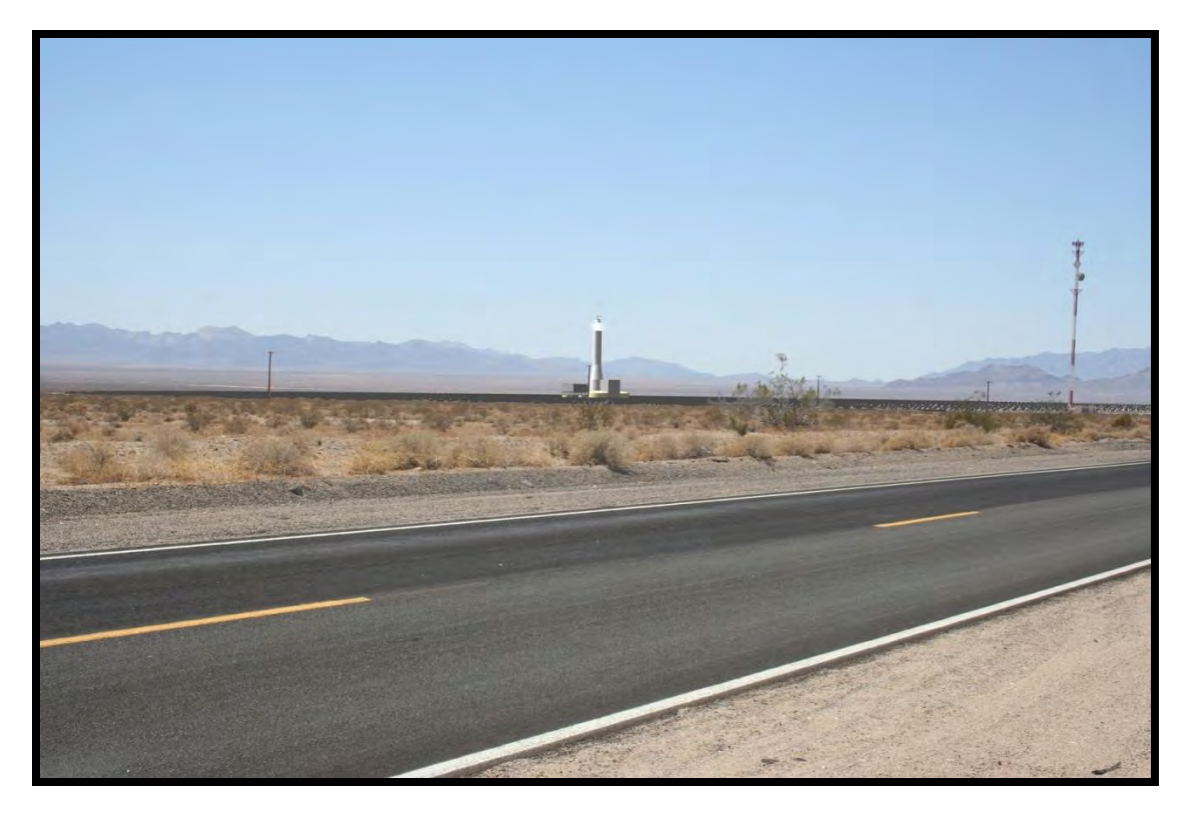
Lead Agency U.S. Department of Energy Western Area Power Administration Lakewood, CO Loan Guarantee Program Washington, DC

Cooperating Agency U.S. Department of the Interior Bureau of Land Management Palm Springs – South Coast Field Office Palm Springs, CA