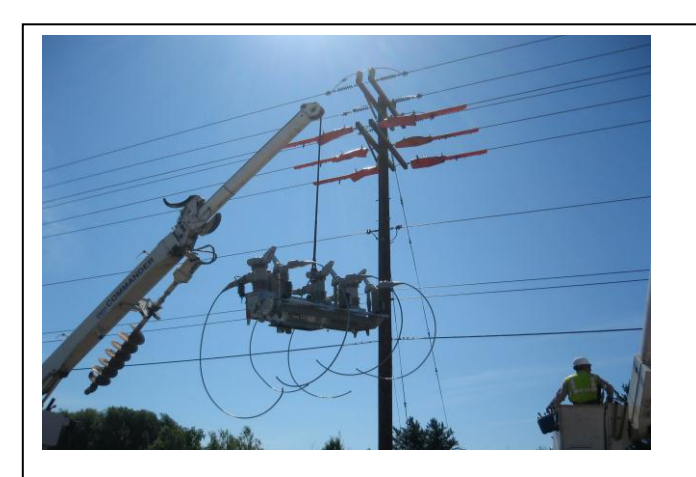
Automated feeder switches being installed by Minnesota Power's field crews.