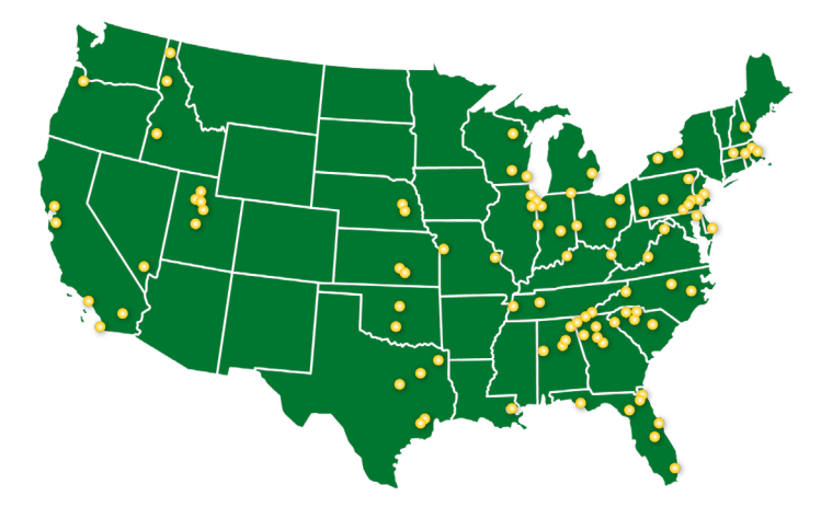
Figure 1. IAC Assessments Nationwide, January – March 2020

Plants assessed were located in 33 states (Figure 1). The plants represent a broad range of industries, with food, fabricated metals and plastics and rubber products being the most common (Table 2).