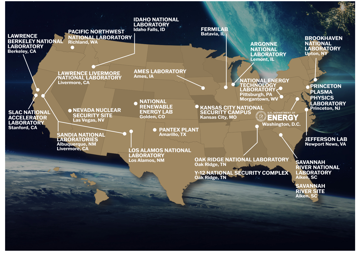
Representation of DOE's National Laboratories, Plants, and Sites

in having this breadth of expertise concentrated within a single organization and having the experience of applying it (particularly through the National Laboratory complex) to highly diverse mission areas. Achieving U.S. space goals will ultimately require tight integration among DOE's National Laboratories, NASA's space flight and research centers, DoD service research laboratories, U.S. universities, private sector partners, and commercial industry. DOE has had decades of experience partnering with these entities to achieve outcomes that are mutually beneficial.