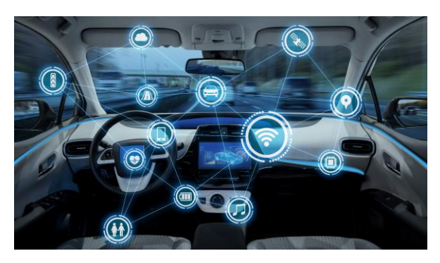
Connected cars utilize cellular and 5G networks, advanced sensors, and high-powered computing to monitor location, driver behavior, engine diagnostics, vehicle activity, and the surrounding environment.

electrification, and smart mobility (ACES). Electric-vehicle (EV) sales are setting records globally, while autonomous vehicles (AVs) are rapidly gaining attention (including cars as a service and smart mobility approaches).<sup>3</sup> Smart mobility is widespread and growing—embracing such diverse modes as ride-sharing, car-sharing, public transportation, walking, scooting, and biking. Connected modern vehicles with multiple sensors, on-board computing, and communications systems operate as a mobile Internet and data source.