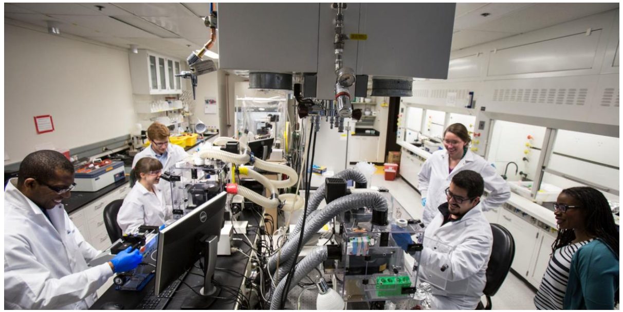
Graduate students and post-docs collaborate in a University of Michigan research lab.

challenges potentially include deficits in education and workforce development; policies and regulations that may impede innovation; and limits on finance and investment pathways.