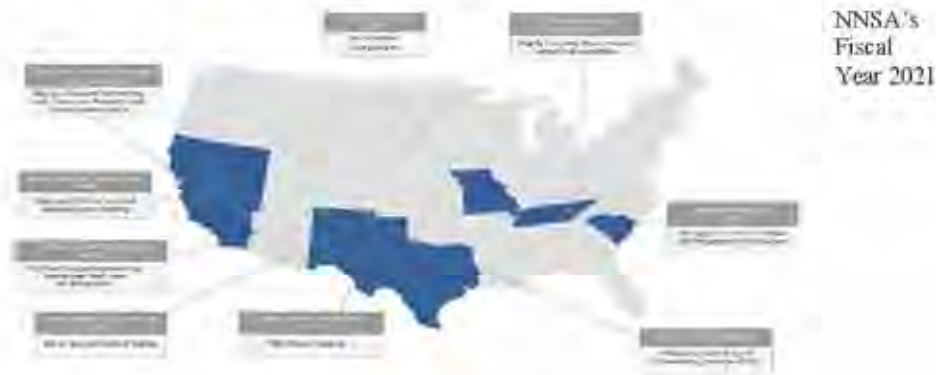
Figure 2-1. DOE/NNSA Sites Associated with Pit Production Mission

This map from the Final Complex Transformation Supplemental Programmatic Environmental Impact Statement (CT SPEIS) graphically demonstrates how pit production mission is spread from coast to coast, and how the agency was aware of its programmatic nature in 2008.