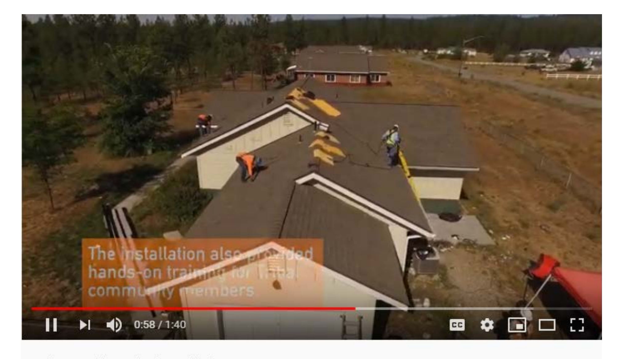
Spokane Tribe solar installation