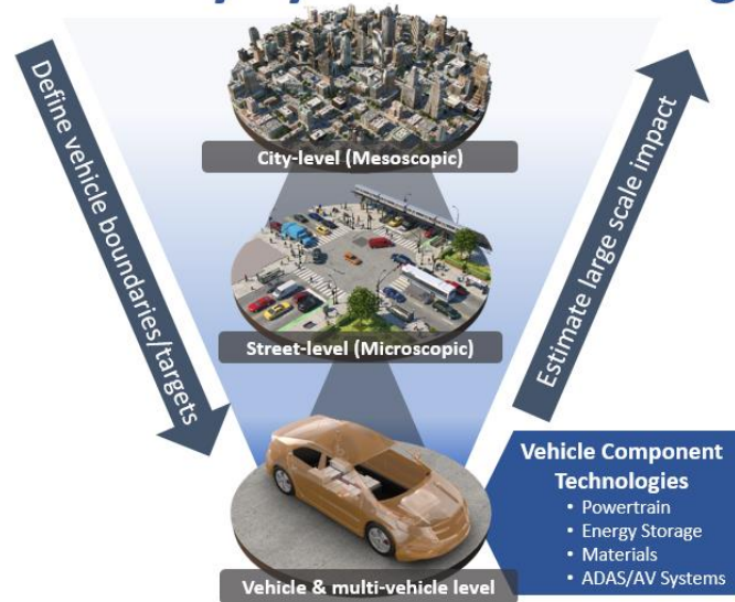
Figure 1. VMSATT connects advanced vehicle component technologies to mobility systems context for evaluation and validation of energy-relevant insights.

The target audiences for VMSATT work includes decision makers within the Partnership, external stakeholders in the technical community, and policymakers. VMSATT will document its findings in the public domain, for example in National Laboratory reports and/or peer reviewed scientific papers.