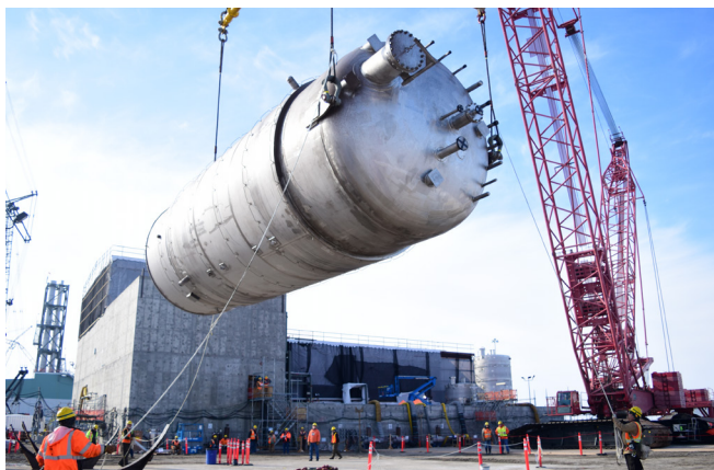
The entire site is supporting a shift to 24/7 operations to treat tank waste, including workers building the Effluent Management Facility for treating secondary waste from vitrification.

In August, the control center for the LAW Facility at WTP opened its doors for commissioning and welcomed technicians who are bringing treatment systems online. In December, the plant's Analytical Laboratory welcomed its first chemists and equipment that will ensure waste immobilized in glass meets disposal requirements. Throughout the year, workers installed major pieces of processing equipment in the plant's Effluent Management Facility that will treat secondary waste from vitrification in WTP.