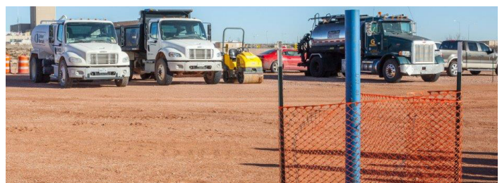
A blue pipe marks the spot where WIPP's largest shaft, the 30-foot diameter utility shaft, will be sunk 2,200 feet to the WIPP underground. Crews are routing power from a commercial substation on the east side of WIPP to the utility shaft site on the west side.

Significant progress was made in 2019 on the largest capital improvement projects at WIPP since its initial construction. This includes the Safety Significant Confinement Ventilation System (SSCVS), which will be the largest containment fan system in the DOE complex and will significantly increase airflow underground. Work on the system's three major facilities has included subsurface excavation, concrete pours, installation of steel components, and laying of utilities. Work also got underway on a new utility shaft. The 30-foot-diameter shaft will descend 2,200 feet, and will be the largest at WIPP, providing air intake for the SSCVS. Additionally, the site began paving an on-site bypass road that will relocate busy area oilfield traffic away from the WIPP site.