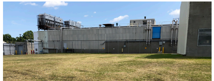
Restored area where Building G2 stood.