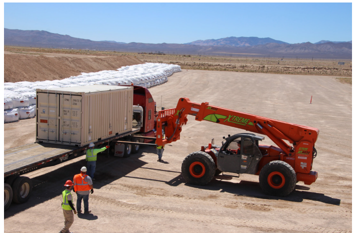
The final waste shipment from a Soils site is unloaded for permanent disposal at NNSS.

Environmental corrective actions and waste shipments were safely completed at the last remaining site where surface/near surface soils were contaminated by a historical nuclear safety experiment. As a result, the Soils project was completed six years ahead of schedule with an estimated cost-savings of $66 million.