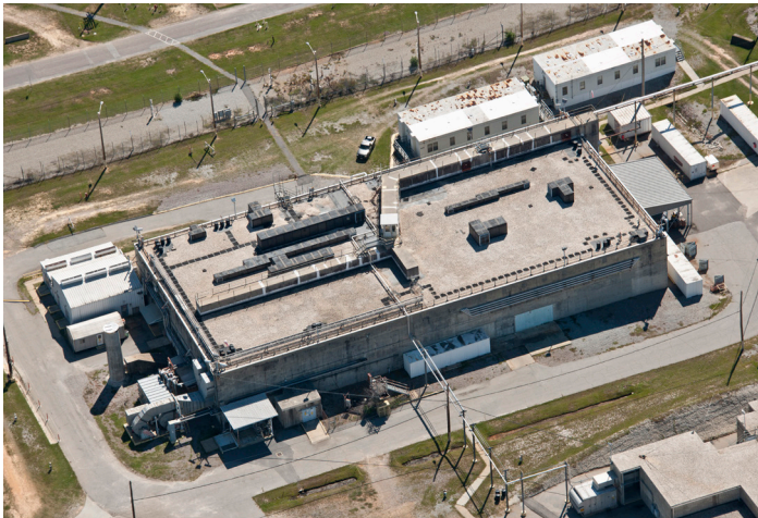
SRS made progress toward the “cold and dark” deactivation of the 235-F facility, parts of which were once used to manufacture plutonium pellets for the NASA space program.

near the site's decommissioned P Reactor. The site also restored the G Area oil seepage basin to residential standards by filling it with 1,400 tons of stone and 7,000 yards of dirt before capping it with grass.