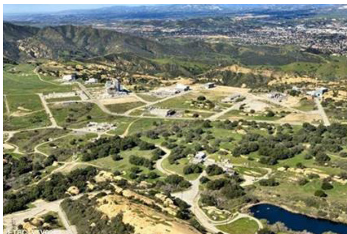
Energy Technology Engineering Center in Area IV of the Santa Susana Field Laboratory.

of remaining DOE buildings at the site. DOE anticipates beginning demolition in 2020, which is an important step forward to final cleanup.