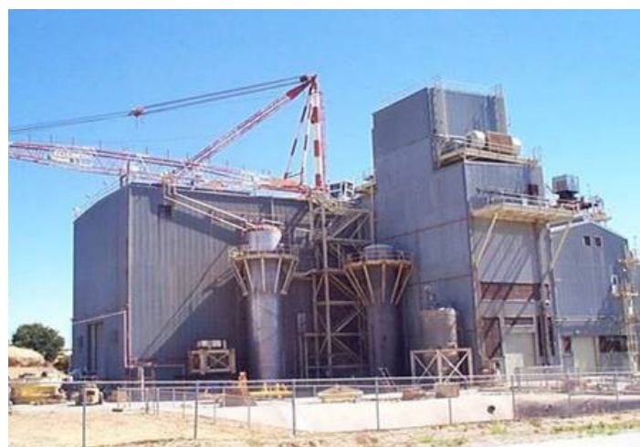
Energy Technology Engineering Center — Sodium Pump Test Facility.