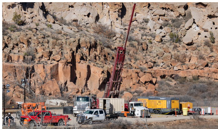
Data from the monitoring well R-70 is being used to further characterize the eastern edge of the chromium plume.

Along the plume's southern edge, chromium levels decreased significantly at the monitoring well nearest to the boundary between LANL and the Pueblo de San Ildefonso. Latest results at that well showed chromium levels were below state regulatory limits. Field and laboratory studies continue in pursuit of determining a final remedy for the plume.