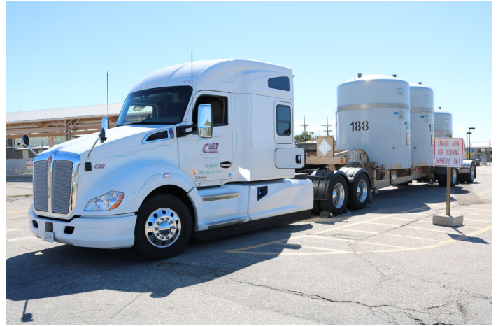
Several TRU waste shipments were made from Area G to WIPP.

With regular TRU shipments to WIPP throughout the year, EM-LA set the foundation for getting legacy waste offsite throughout the remainder of its mission. Two nuclear waste remediation process lines were stood up at Technical Area 54's Area G, which will ensure TRU waste continues to be ready to ship, as the schedule permits.