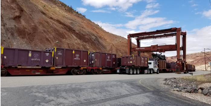
A haul truck approaches the Moab site's gantry crane. The gantry crane loads locked containers on the train's rail cars.

Shipments of contaminated debris ramped up in 2019. Debris left over from disassembly of the former mill requires special attention before it's transported for disposal because of its large size, jagged shape, and degree of contamination. Over the year, the project shipped more than 53,000 tons of debris to the Crescent Junction disposal cell.