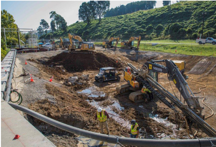
Construction began on the Outfall 200 Mercury Treatment Facility, which is vital to large-scale cleanup at Y-12.

Y-12's large, deteriorated, mercury-contaminated facilities and subsequent soil remediation, by providing a mechanism to limit potential mercury releases into the Upper East Fork Poplar Creek. When operational, the facility will be able to treat 3,000 gallons of water per minute, and it includes a 2-million-gallon storage tank to collect stormwater. The facility will help Oak Ridge meet regulatory limits in compliance with EPA and State of Tennessee requirements.