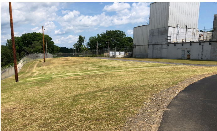
Former Building H2 Footprint.