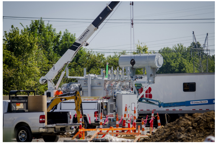
At Paducah, a new TVA substation will allow the site to right-size utilities for cleanup and provide ancient infrastructure (scrap metal) to PACRO to sell.

Construction neared completion on a new TVA substation to provide power needs to the site, removing aging switchyard infrastructure, decreasing costs, removing DOE dependence on infrastructure operations, and positioning the site for a more efficient cleanup.