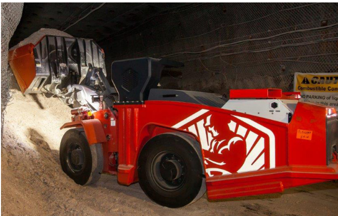
WIPP's first all-electric vehicle, a load-haul-dump, is already working in the underground. Its batteries are recharged from an underground power station.

The first battery-electric load-haul-dump machine was put into use underground in 2019, as part of an initiative to move to a predominantly battery-electric fleet of vehicles. This is possible because of improvements in battery technology in recent years. For worker health and safety, diesel equipment use has been restricted underground as reduced airflow results in air quality issues. Battery-electric equipment allows for needed work to continue underground without these restrictions.