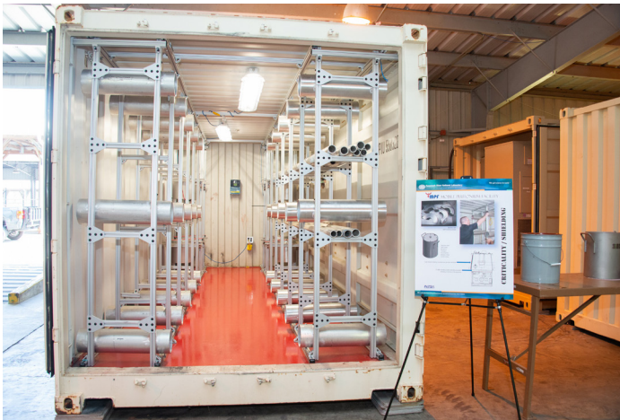
Mobile Plutonium Facility “Lite” Module.

In October, SRNL rolled out the Mobile Plutonium Facility (MPF) “Lite,” a modular, self-sufficient system that can be rapidly deployed to recover nuclear materials from foreign weapons programs more nimbly and efficiently than SRNL’s original MPF. The MPF Lite reduces transportation constraints, increases system capacity and throughput, and eliminates refurbishment costs. The old system’s glovebox modules’ weights made transportation difficult, requiring specialized handling equipment and assembly procedures that increased risk and reduced mobility. The former system was also constrained by its furnace size, which limited throughput, prolonging processing time.