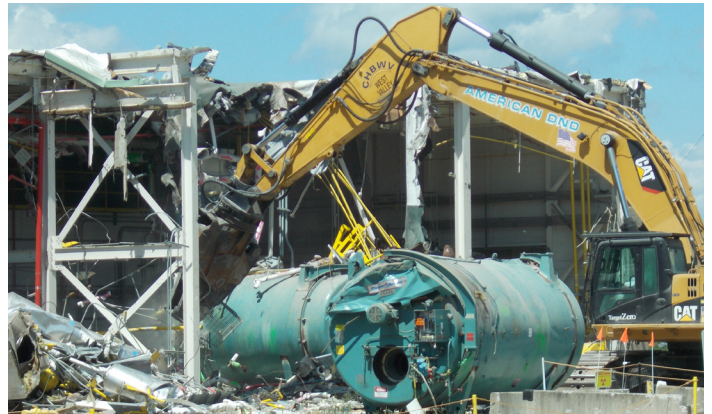
Workers at the WVDP use a large excavator with a shear attachment to demolish the Manipulator Repair Shop.

In addition to removing the four support facilities, crews demolished another 15 structures and restored the areas where they were located. These included the Low-Level Wastewater Treatment O2 Pad, North Plateau Pump and Treat System, Waste