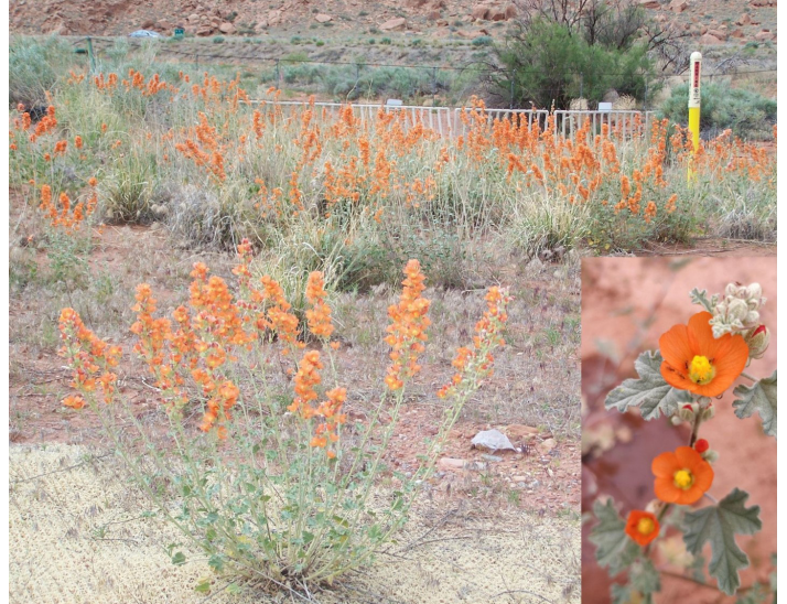
Globe mallow planted by project staff thrives on the Moab site.

At the Moab site, staff removed invasive plant species and continued to revegetate the land to stabilize and restore it with native plant life. In addition, sustainability efforts reduced water usage, supported honey bees and wildlife, and promoted sustainable vegetation for years to come.