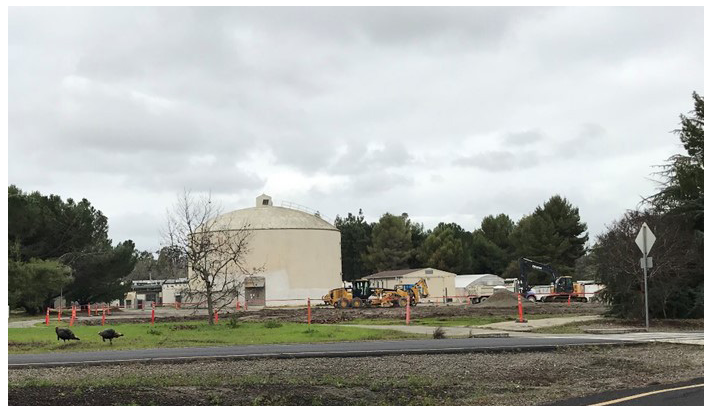
LLNL Building 280 Area - March 2019.

In addition to the building demolition contracts, a technical support contract was awarded to provide technical and administrative services in support of the EM-LLNL Projects.