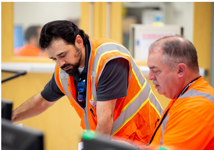
Commissioning technicians opened the control center for the LAW Facility at Hanford that will begin treating tank waste by the end of 2023.

The Soil and Groundwater program once again exceeded annual goals for volume treated and contamination removed and reduced the areas of contamination near the Columbia River. In 2019, workers treated more than 2.4 billion gallons and removed 90 tons of contaminants. With each passing year, the program's innovations are improving the efficiency of treatment systems.