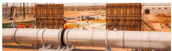
With its 24-section slab poured, wall support work has begun at WIPP's Salt Reduction Building.