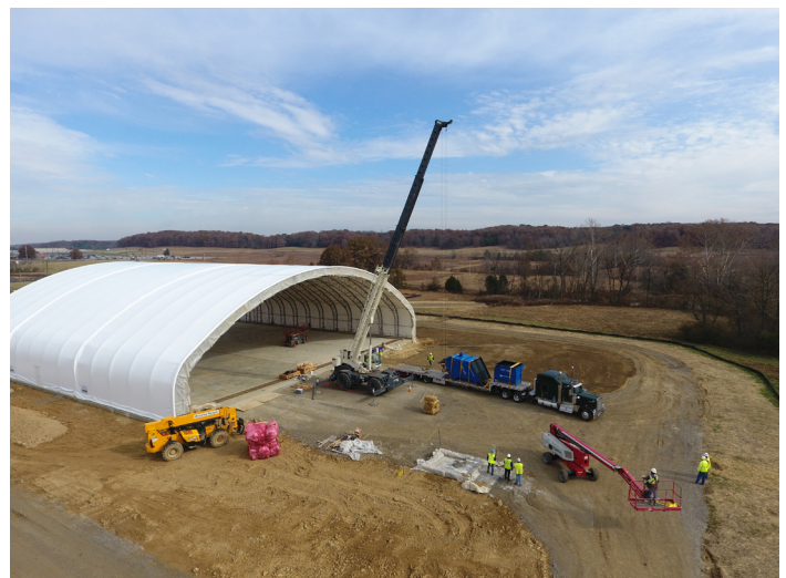
At Portsmouth, the X-622-1 Water Treatment System construction in progress will be a key support function for the upcoming X-326 process building demolition.

Progress continued on the deactivation of the X-333 Process Building. The building completed over 50-percent of the associated scope to be declared “cold and dark” – a term meaning the facility is isolated from all external sources of hazardous energy – by a March 2021 contract milestone.