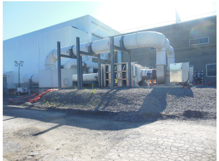
Building G2 prior to demolition.

In 2019, DOE completed field work and site restoration at the Separations Process Research Unit, the site of the former research facility that supported improvements in the chemical separation of plutonium early in the Cold War. The former Buildings H2 and G2 work areas were backfilled and restored. The backfill and grading of the H2 excavation required more than 35,000 tons of imported fill. Once the documentation of cleanup is finalized, the restored areas will be returned to the Office of Naval Reactors. Return of the areas is expected in 2020.