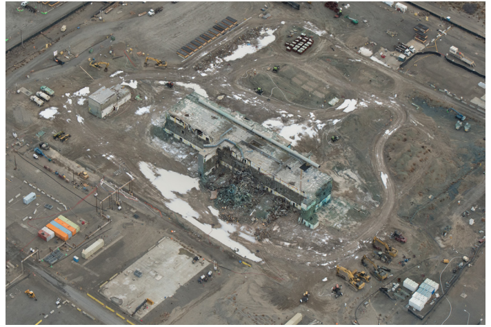
The skyline at the Hanford Site changed for the better as workers safely leveled the main processing facility at PFP.

Throughout 2019, one of the site's most critical risk reduction efforts continued at PFP. In the past year, workers removed large sections of the main processing building.