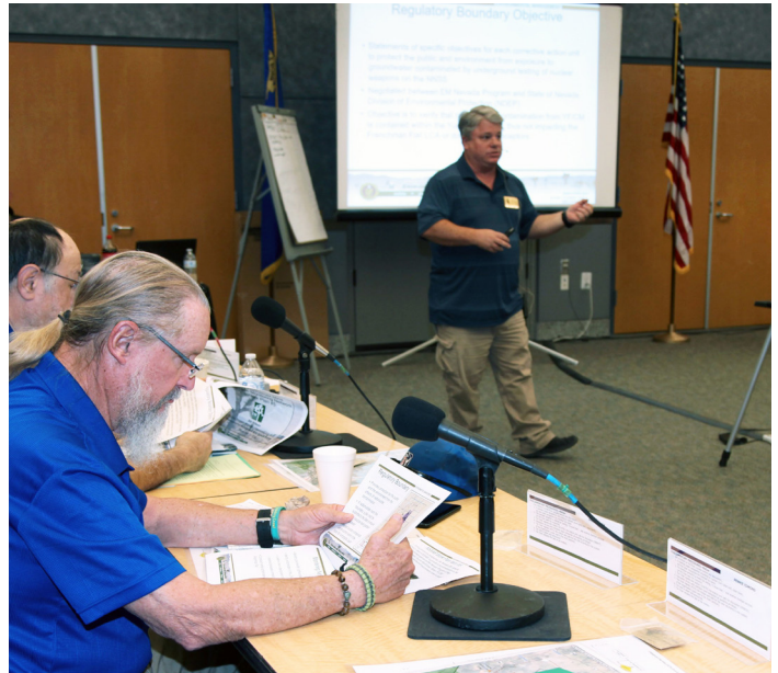
Information was shared on Yucca Flat/Climax Mine Long-Term Monitoring during a Nevada Site Specific Advisory Board meeting.

Furthering its commitment to transparency and promoting awareness, the EM Nevada Program engaged in numerous stakeholder interactions in 2019. This included hosting multiple Nevada Site Specific Advisory Board public meetings, intergovernmental meetings, a Groundwater Open House, and site tours. Additionally, more than 3,500 Operation Clean Desert educational materials were distributed to the site’s public reading room, to the Groundwater Open House, and to local schools.