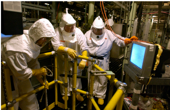
The project to move highly radioactive sludge from an aging reactor spent fuel basin to safe, interim storage was completed ahead of schedule and under budget in October 2019.

On October 1, Hanford's past, present, and future were on display as elected officials, tribal representatives, regulatory personnel, and stakeholders joined the Department, contractors, and workers near the Columbia River to celebrate the completion of transferring highly radioactive sludge from the K West Reactor basin to safe storage in the center of the site. The sludge transfer, which was completed three months ahead of the Tri-Party Agreement milestone and under budget, removes another risk to the river and the community, and puts the Department on a clear path to reducing annual operating costs and ultimately "cocooning" the last two Hanford reactors.