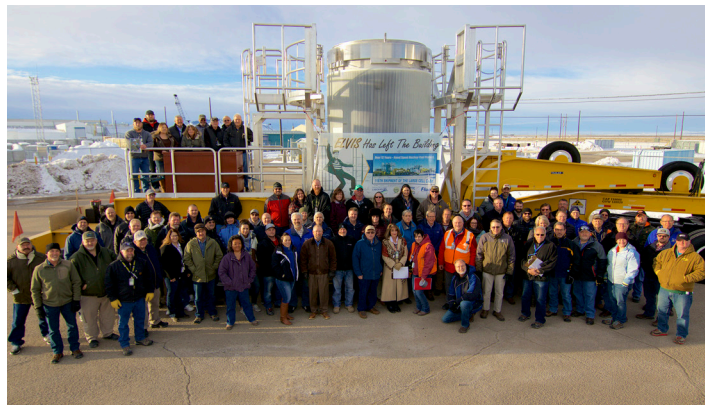
Fluor Idaho employees celebrate the last shipment of Navy spent nuclear fuel from the Idaho Nuclear Technology and Engineering Center.

The cleanup contractor continued to make significant safety improvements during 2019. Employees surpassed more than 4.7 million hours without a serious injury or lost workday and 1 million hours without a recordable injury. DOE awarded the contractor the Volunteer Protection Program Star of Excellence Award, a significant recognition of the contractor's commitment to safety.