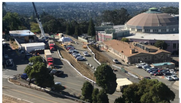
LBNL Old Town - September 2019.

The Bayview Parcel 1 Cleanup Project includes demolition and removal of the former Bevatron utility tunnels and related concrete slab, grade beams, pilings, and associated contaminated soil; and removal of the demolition debris and soils. All demolition and excavation will be conducted in a manner that will not impact LBNL research operations. The Bayview team completed characterization and is in the process of deactivating the Bayview Parcel 1 South area in preparation for tunnel demolition.