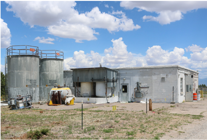
The project team prepped Building 257, the last building at Technical Area 21, for demolition.

Now, only one building remains — Building 257. In addition to preparing for building demolition, in 2019 the project team cleaned up the landscape and in the process shipped more than 1,400 cubic meters of rubble from Technical Area 21.