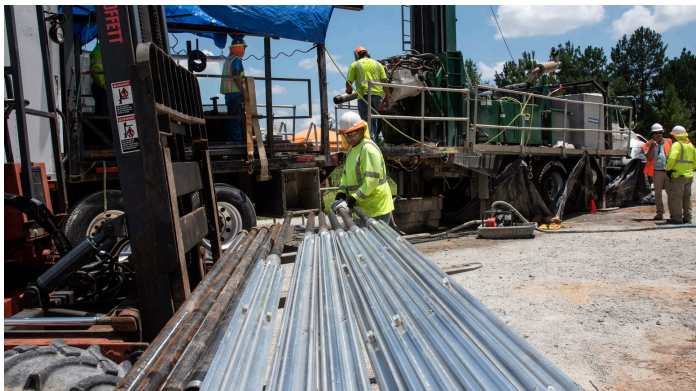
Workers completed construction of a water-permeable iron wall, made from iron filings recycled from automotive engines, to treat groundwater contaminated by solvents in a section of the aquifer beneath SRS.

The SRS liquid waste contractor completed all physical work, documentation, and reviews for the liquid waste portion of the SWPF project. The liquid waste side is ready for the future operation of SWPF as it gets closer to commissioning. The contractor operational readiness review was completed at SWPF along with a design capacity performance test, confirming that SWPF can process more than 7.3 million gallons of liquid waste per year.