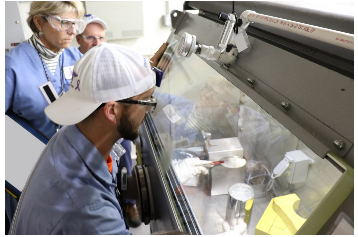
Through an innovative public-private partnership, Isotek employees are extracting rare isotopes from the uranium-233 inventory that the company TerraPower will use for next-generation cancer treatment research.

EM has removed approximately half of the inventory of uranium-233 housed in ORNL's Building 3019, which is the oldest operating nuclear facility in the world. Removing the rest of the highly enriched fissile material is EM's highest priority at ORNL. In 2019, EM began the next major phase of the project which involves processing the remaining inventory into a disposal-ready form. This work was able to begin a year ahead of schedule through an innovative public-private partnership that is saving taxpayers $90 million and providing unique isotopes from the inventory of uranium-233 to aid in next-generation cancer research.