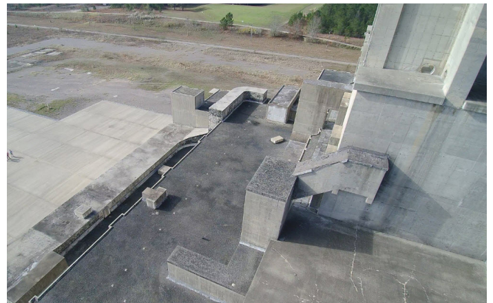
Unmanned aerial vehicle view from above an entombed reactor building at SRS.

SRNL has employed unmanned aerial vehicles (UAVs) as a more efficient and less expensive method to locate and eliminate potentially damaging vegetative growth on the entombed reactor buildings at SRS. The successful entombments completed in 2011 of the P and R nuclear production reactor facilities were the first in the DOE complex and the largest nuclear facility in-situ decommissioning achievements in the world. A long-term maintenance plan ensures the integrity of the entombed structures over time. SRNL remotely captured high-resolution, close-up video of the rooftops of the entombed reactor buildings using a commercial UAV, providing a more thorough inspection than was possible by a helicopter crew and site photographer, at half the cost. SRNL also partnered with Virginia Polytechnic University to build a special hexacopter equipped with a targeted herbicide spray apparatus to treat unwanted vegetation on the rooftops of the reactors.