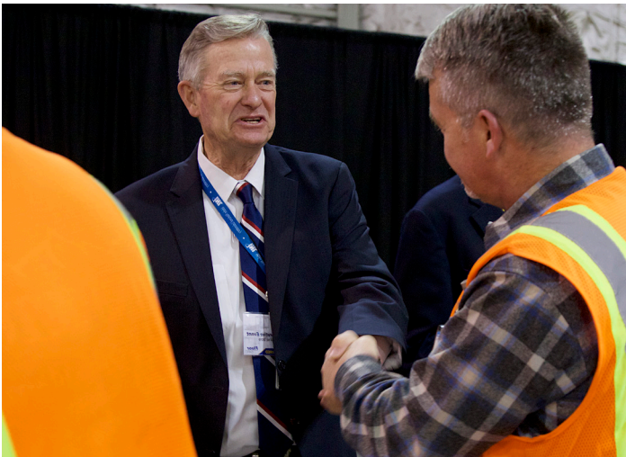
Idaho Gov. Brad Little congratulates an AMWTP employee at an October event to commemorate the completion of transuranic waste debris treatment.

The final design for a landfill cover over the SDA was completed four months ahead of schedule and was approved by DOE, the state, and EPA. The 150-acre cover, consisting of native rocks, soil, and plants, is designed to protect the underlying Snake River Plain Aquifer.