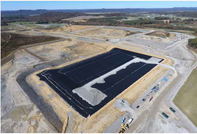
At Portsmouth, Cell 1 Liner of the OSWDF has been completed and will be ready to accept the first waste placement in 2020.