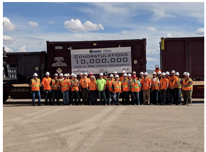
Crescent Junction staff gathers among shipping containers to commemorate 10 million tons of waste relocated from the Moab site to the Crescent Junction disposal cell.

The project marked its 10-year shipping anniversary in April 2019. In September, the project reached another milestone and commemorated 10 million tons of RRM shipped from the former uranium-ore mill to the disposal cell. In October, DOE hosted a community celebration to recognize the project's progress.