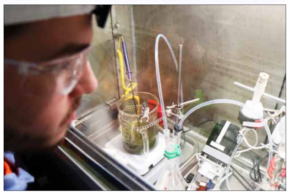
Workers extract thorium from U-233 using a series of gloveboxes to avoid contact with the material or chemicals used in the process. It begins by mixing the uranium with nitric acid.

The Department of Energy's (DOE) Oak Ridge Office of Environmental Management (OREM) hosted multiple events in November aimed at providing local expertise and resources to support new technologies at the national and international levels.