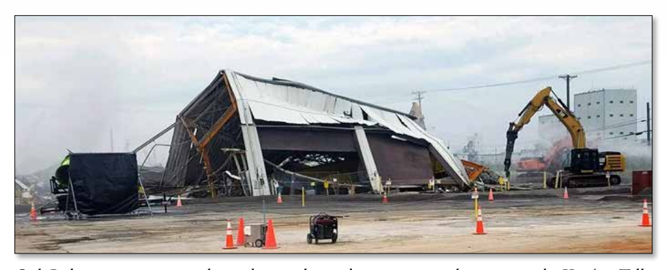
Oak Ridge crews spent several months completing deactivation work to prepare the K-1423 Toll Enrichment Facility for demolition.

Workers have finished demolition and debris removal of the 30,817-square-foot K-1423 Toll Enrichment Facility. The building was originally used to transfer liquefied uranium hexafluoride to cylinders for the plant's uranium