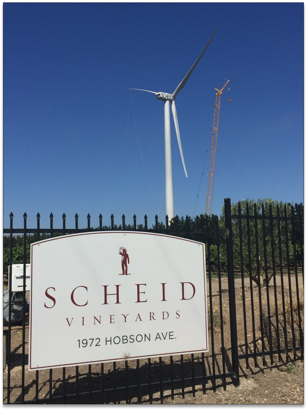
The Scheid distributed wind installation is Foundation Windpower's third Salinas Valley project.