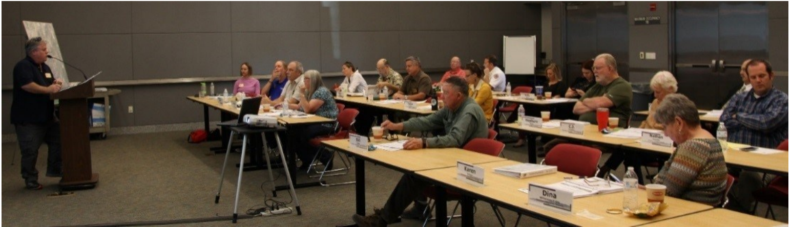
Members of the Nevada Site Specific Advisory Board at orientation.