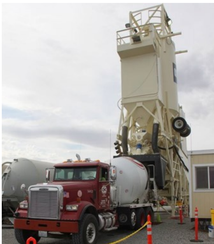
Workers began filling PUREX No.2 waste storage tunnel with engineered grout.