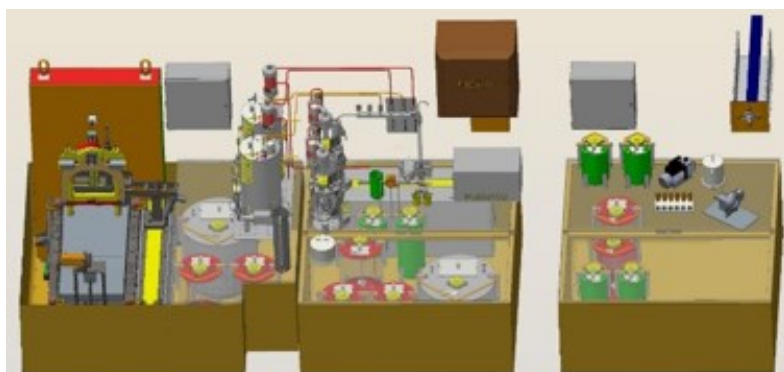
SRNL Shielded Cell layout configured for Pu-244 recovery from Mark-18A targets.

Installation and operation of spectrophotometers in H Canyon River Site D Area Powerhouse Ash Basin cleanup project.