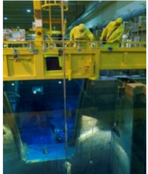
Workers extract spent nuclear fuel from the CPP-666 spent fuel basin as part of a project to move all spent fuel from wet to dry storage.

Spent nuclear fuel handlers continued to make progress transferring fuel from wet to dry storage. Transfers of all spent nuclear fuel received from Naval Reactors is scheduled for completion in 2019. The spent nuclear fuel storage basin at INTEC is 91 percent emptied.