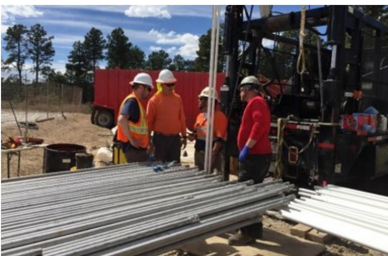
Workers review safety procedures prior to groundwater sampling system installation.