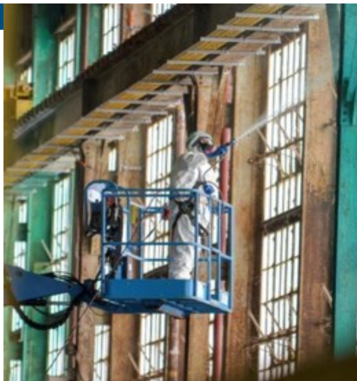
Deactivation of the C-400 Cleaning Building moving quickly.

At the C-360 building, deactivation activities provide workers with training needed for the large process buildings in the future. The new deactivation and remediation contractor completed 100 percent of Non-Destructive Assay characterization activities and removed 80 percent of uranium deposits.