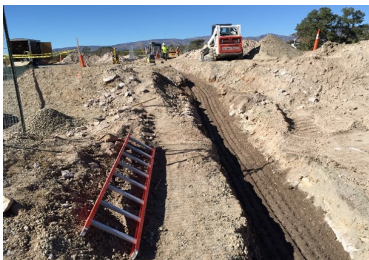
Over three miles of pipeline were installed in 2018 for Chromium Interim Measure and Characterization Campaign.