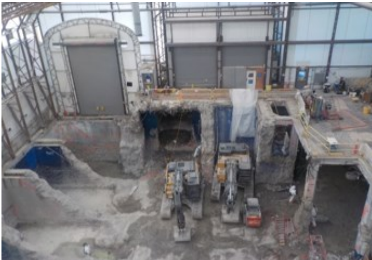
Partial demolition under tent enclosure.

Decommissioning and decontamination of the Building H2 and associated tank farm involved removal and disposal of nine 10,000-gallon tanks, a 5,000-gallon tank, numerous process vessels, and over 22,700 linear feet of piping. Over 19 million pounds of concrete were removed and disposed of during demolition.