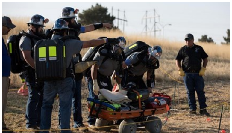
WIPP's Red and Blue Team members were top contenders in this year's National Mine Rescue Contest.