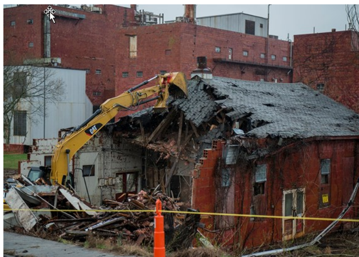
Removal of two high-risk excess contaminated facilities in Y-12's Biology Complex.

Oak Ridge continued to safely ship transuranic waste to the Waste Isolation Pilot Plant. Employees have prepared almost 50 shipments, sending 1,540 drums of transuranic waste for permanent disposal. These shipments are helping the site move closer to fulfilling its regulatory commitments.