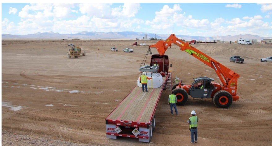
Low-level radioactive waste is off-loaded for permanent disposal.

The EM Nevada Program is also responsible for ensuring low-level and mixed low-level radioactive waste, classified non-radioactive waste, and classified non-radioactive hazardous waste (generated by legacy cleanup in Nevada and across the nation) are safely disposed at the NNSS.