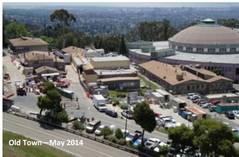
Old Town—May 2014

A major phase of the overall demolition project has begun with commencement of Phase V of the cleanup. This project addresses two buildings -- Building 4 and Building 14. These buildings are being deactivated in preparation for their removal. This space will support the future needs of the Office of Science once building demolition and any soil remediation is complete.