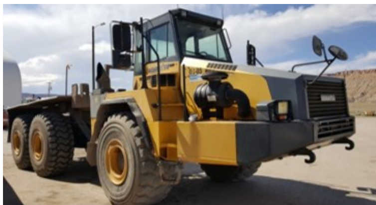
Two new haul trucks were added to maintain worker safety, environmental protection, and project execution.