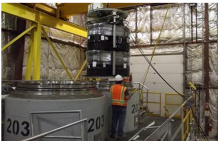
Workers load transuranic waste for shipment to WIPP.

Per the Idaho Settlement Agreement, workers are treating the remaining TRU waste at the site, and are down to the last 2,200 cubic meters. Shipments of contact-handled transuranic waste to WIPP increased during the year to as many as seven per week.