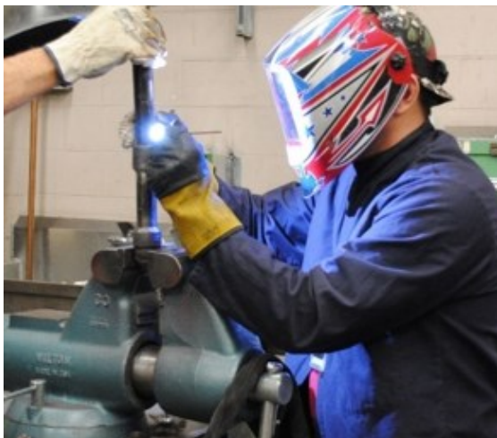
Savannah River Remediation employee safely completes welding work at the Defense Waste Processing Facility.