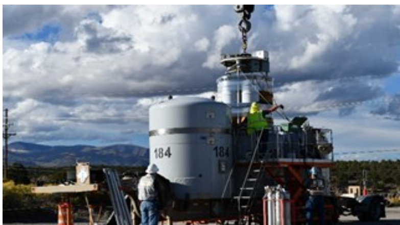
N3B waste management staff prepare waste shipment for transport.

The year was a pivotal one for the Chromium Interim Measure and Characterization Campaign, EM-LA's priority cleanup activity. To continue addressing the hexavalent chromium plume in the regional aquifer beneath Sandia and Mortandad canyons, the project team implemented the Interim Measure (IM), which involves extracting contaminated water and injecting treated water to control plume advancement and shrink its footprint. The IM campaign is underway along the plume's southern boundary. In the coming year it will be fully implemented, while field and laboratory studies progress in pursuit of determining a final remedy for the plume.