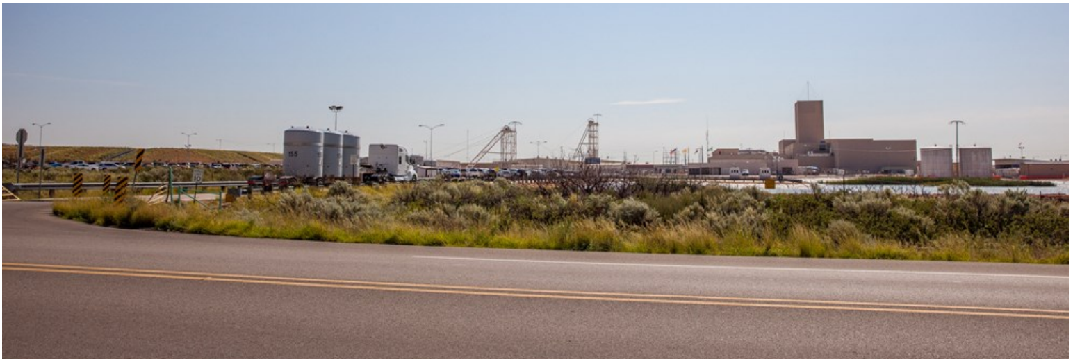
A shipment of transuranic waste arrives at the WIPP facility for permanent safe disposal.

Shipments of transuranic waste to WIPP, critical to cleanup and closure of EM sites across the complex, are carefully and safely ramping up after the resumption of shipments in 2017. WIPP is now averaging between five and 10 shipments per week, with more than 310 shipments received in 2018.