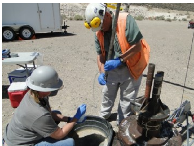
Crews collect groundwater samples.