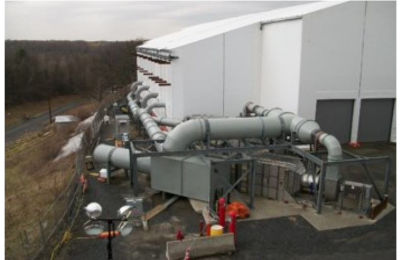
H2 under tent enclosure for decontamination and demolition preps.