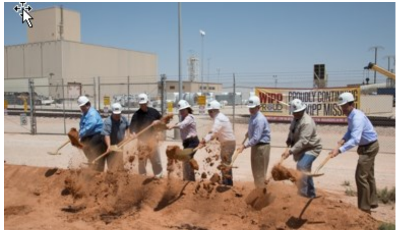
EM Assistant Secretary Anne White, fourth from left, participates in the June 14 groundbreaking for the Safety Significant Confinement Ventilation System.

Full operations resumed at the Waste Isolation Pilot Plant with the restart of mining in Panel 8 in January. Mining is done on a continual basis so that waste panels are ready only when needed because the natural movement of salt closes the panels. Waste emplacement is currently conducted in Panel 7, and more than 19,000 tons of salt have been removed from Panel 8 to date.