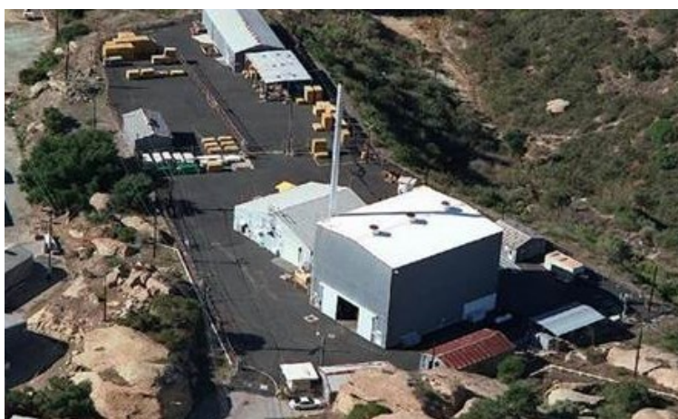
Radioactive Materials Handling Facility.

The ETEC groundwater team completed a Corrective Measures Study to develop and evaluate possible corrective action alternatives to address groundwater at the site. This study, a requirement of the Resource Conservation and Recovery Act, was submitted to the State of California, the site regulator.