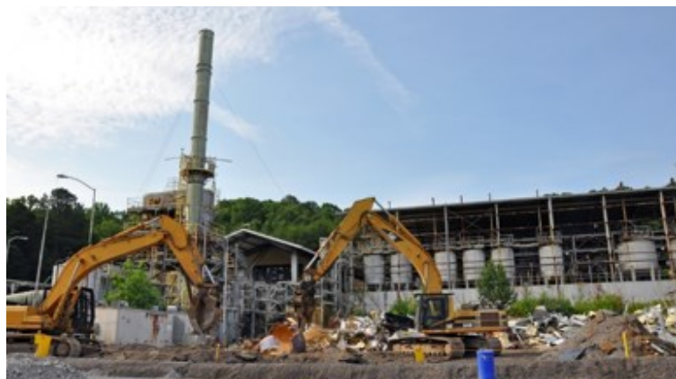
Workers demolished the TSCA Incinerator.