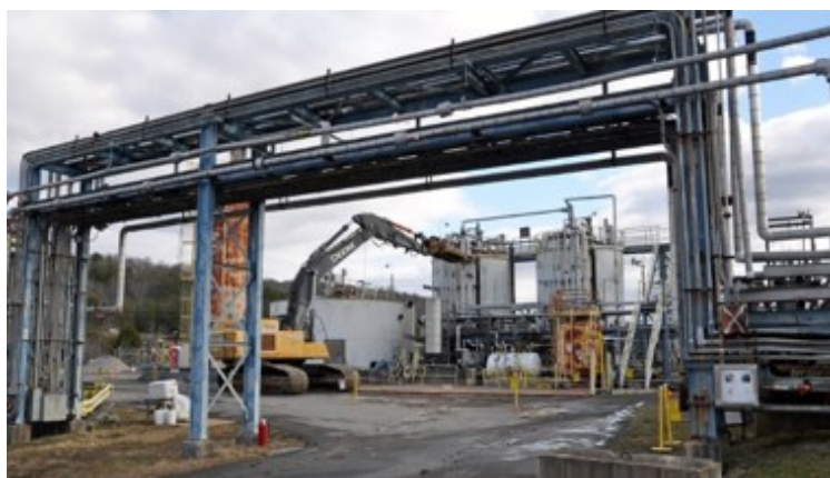
Teams took down the Central Neutralization Facility.