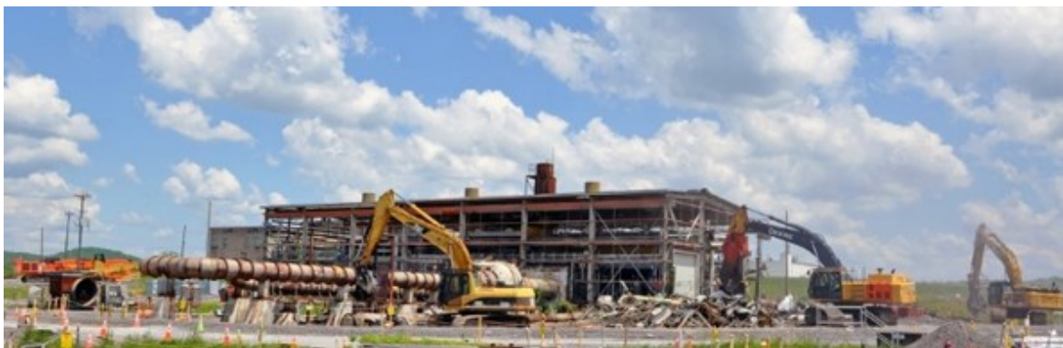
Crews demolish Building K-633 in the Poplar Creek area.

EM's vision for ETPP as a privately-owned industrial park is already being realized. The Department of Energy has transferred more than 1,200 acres from government ownership to the local community for economic redevelopment.