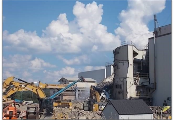
WVDP Vitrification Facility—Before and After.