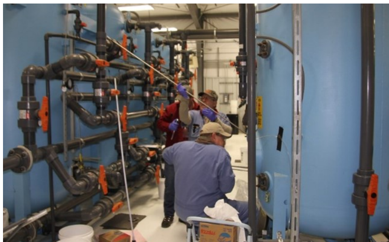
A record 2.3 billion gallons of groundwater treated at the lowest cost in the Site's history.