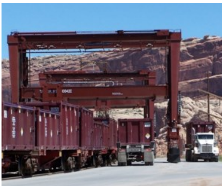
Project staff load a train with containers in Moab, departing for the Crescent Junction site.

The project successfully hit a milestone of 9 million tons of uranium mill tailings shipped to the disposal cell in Crescent Junction, Utah. Efficiencies were found through increasing the number of containers shipped on each train from 140 to 144 by adding a railcar to each trainload. Overall, the project has removed more than 58 percent of the total material to be relocated.