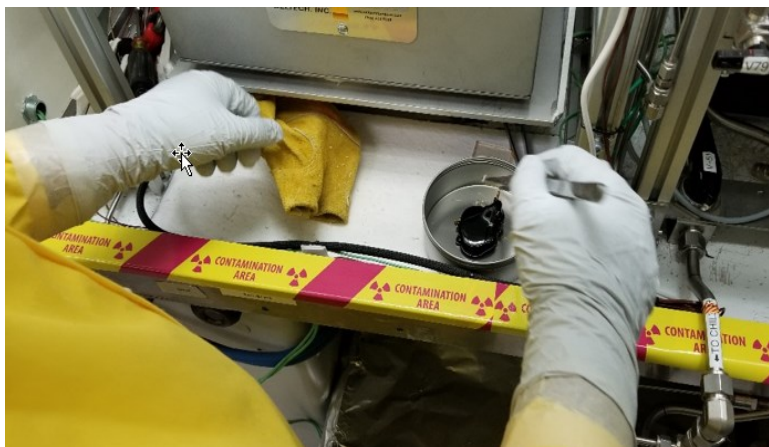
Scientists melt radioactive waste into glass in test platform designed to mimic DFLAW process.

In addition to these efforts, ORP worked closely with the State of Washington to secure key permits for the Effluent Management Facility (EMF) and Analytical Laboratory. EMF is the final WTP support building required to deliver the DFLAW approach. In June, the Analytical Lab became the first major WTP facility to complete all phases of the state's mandated permit lifecycle — from initial design, through groundbreaking and construction, and finally the issuance of an approved operating permit. The key function of the laboratory is to confirm the glass produced by the WTP LAW Facility meets regulatory requirements.