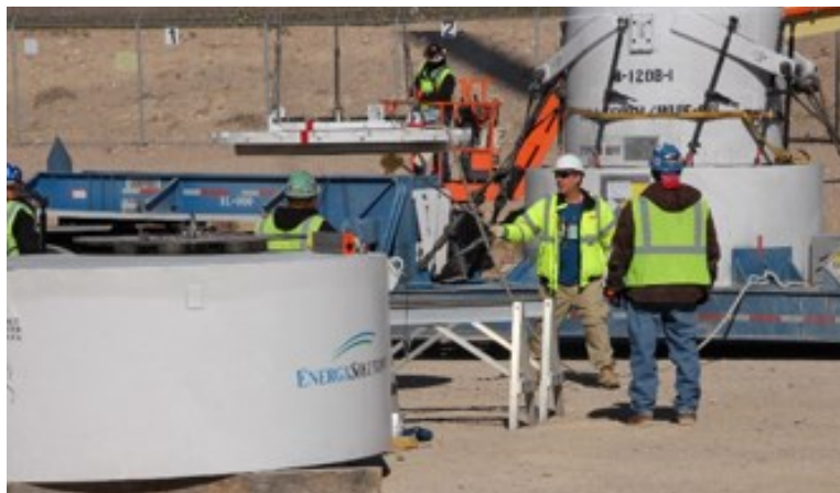
A radiological control technician surveys a cask lid before workers proceed with removing waste packages for disposal.