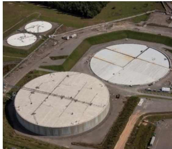
Saltstone Disposal Unit (SDU) 7 is being constructed next to SDU 6.