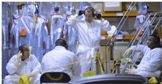
SRS 235-F operators prepare for Material at Risk removal.