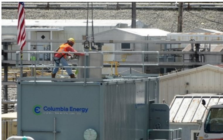
Workers install an ion exchange column on the Tank Closure Cesium Removal process enclosure in the H Tank Farm.

Tank Closure Cesium Removal (TCCR), a pioneer project in waste removal, progressed well in 2018. TCCR features self-shielded ion exchange columns and a specialty resin designed to remove cesium from waste. The groundbreaking process will be the first-of-a-kind in the DOE complex and opens new opportunities for accelerated radioactive waste disposition.