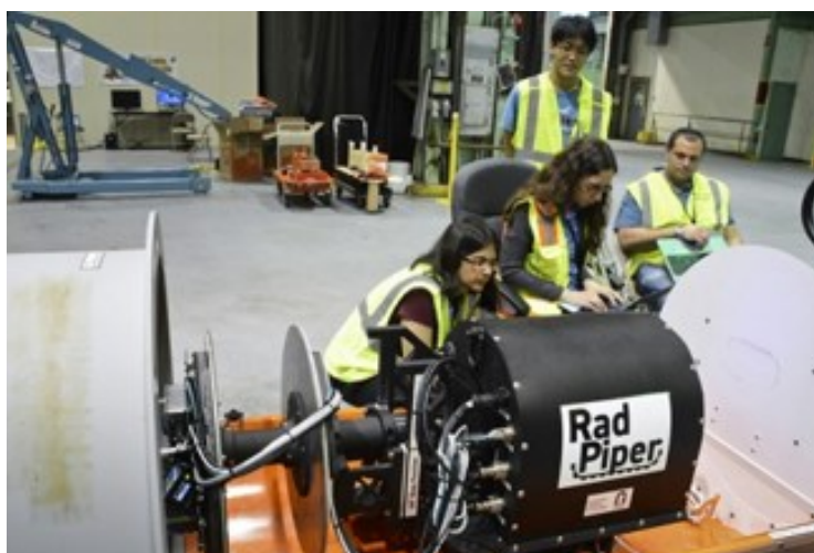
RadPiper, a pipe-crawling robot specialized for autonomous measurement of U-235 deposits, deployed in July.

To facilitate cleanup, DOE and the Ohio Environmental Protection Agency finalized a Natural Resources Damages agreement that will allow for excavation of contaminated material from an existing on-site landfill and plume. The agreement also paves the way for excavation of other landfills and plumes within Perimeter Road to be used as fill in the On-Site Waste Disposal Facility (OSWDF) currently under construction. Removal of contaminated material from landfills and plumes will open more than 1,000 acres of contiguous land for future use.