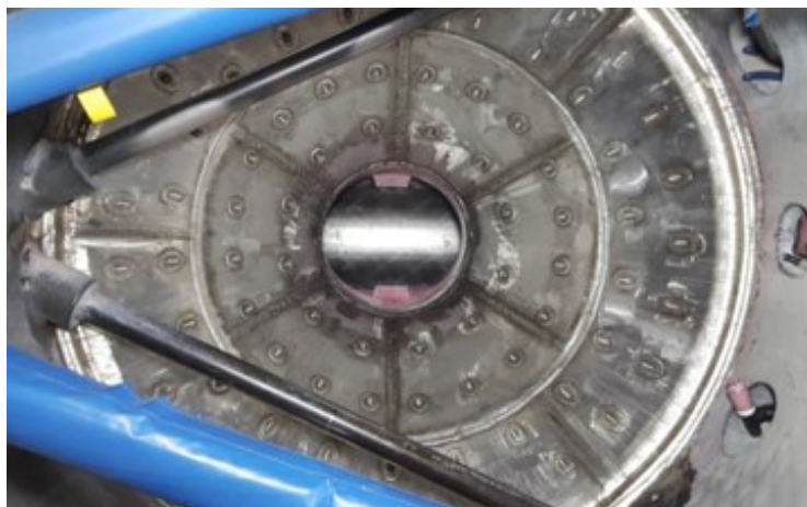
A simulant run successfully demonstrated the design of the Integrated Waste Treatment Unit.

The Integrated Waste Treatment Unit (IWTU), a steam reforming unit constructed to treat 900,000 gallons of radioactive liquid waste, completed a 30-day demonstration run and successfully converted more than 53,000 gallons of liquid simulant into a dry, granular solid. Following process gas filter improvements, the IWTU ended the year in preparations for a 50-day demonstration run, a significant step forward to beginning waste processing.