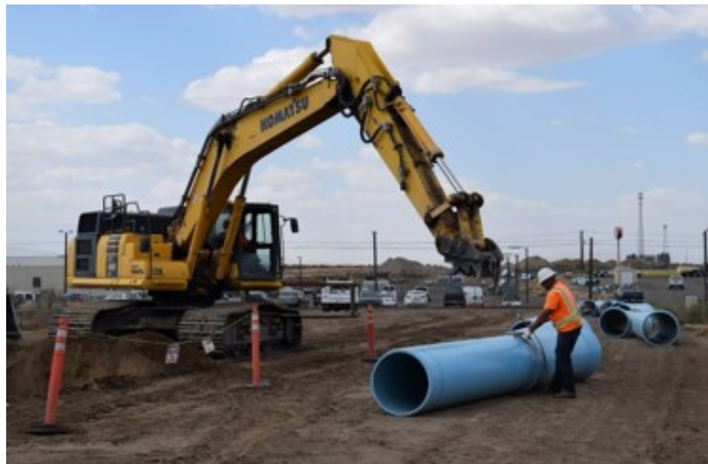
Workers maintain and upgrade infrastructure systems across the site.