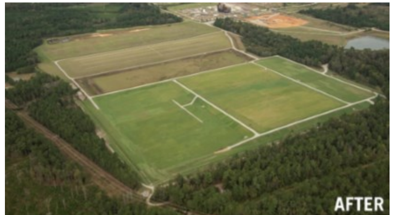
Before-and-after photos of the Savannah River Site D Area Powerhouse Ash Basin cleanup project.