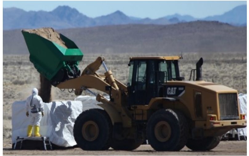
Contaminated soil is packaged at the Clean Slate II site.

Six new members joined the Nevada Site Specific Advisory Board this year. These new members increase the number of representatives from rural communities and support a more representative Board with greater community engagement and feedback.