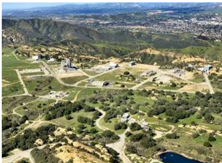
Energy Technology Engineering Center — Area IV.

The Energy Technology Engineering Center (ETEC) reached a milestone in issuing a Final Environmental Impact Statement (FEIS) for cleanup of Area IV and the Northern Buffer Zone, the DOE portion of the Santa Susana Field Laboratory. ETEC developed a process to complete the review of the FEIS document in a little over four months in conjunction with EM Headquarters, a short time-frame supporting improved process and efficiency priorities.