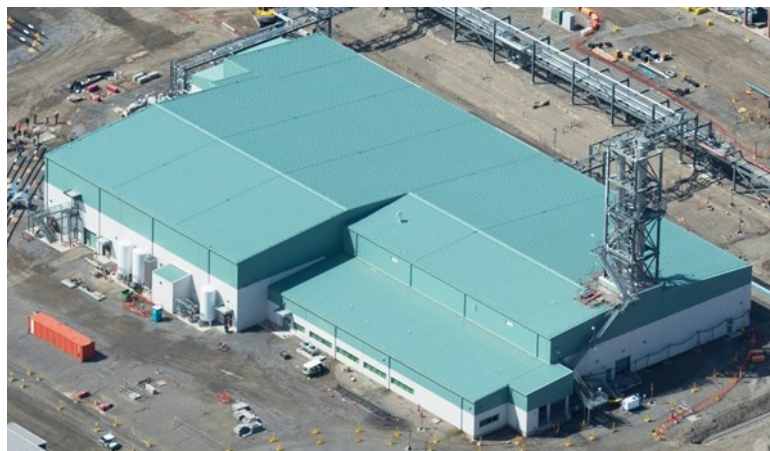
WTP's Analytical Laboratory operating permit marked first major WTP facility to complete all phases of state's mandated permit lifecycle.