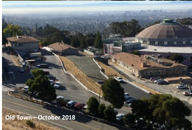
Old Town—October 2018

Before and after photos of the Old Town Area showing progress in site cleanup.