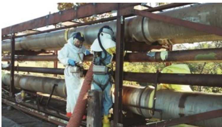
Workers finished removing all four miles of tie lines at ETPP.