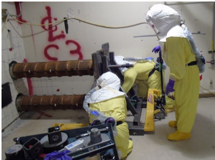
Workers training in a mock-up facility prepare to dig highly contaminated soil out from under the 324 Building.

A new approach for demolition work at the Plutonium Finishing Plant (PFP) has been put in place over the course of the year, culminating in lower-risk demolition work moving forward. The Department, its contractor team, regulators and expert panels collaborated to ensure safe demolition at a steady pace following a 2017 spread of contamination. Armed with a thorough understanding of root causes of the spread, and new safety controls in place, lower-risk demolition work resumed at PFP in September.