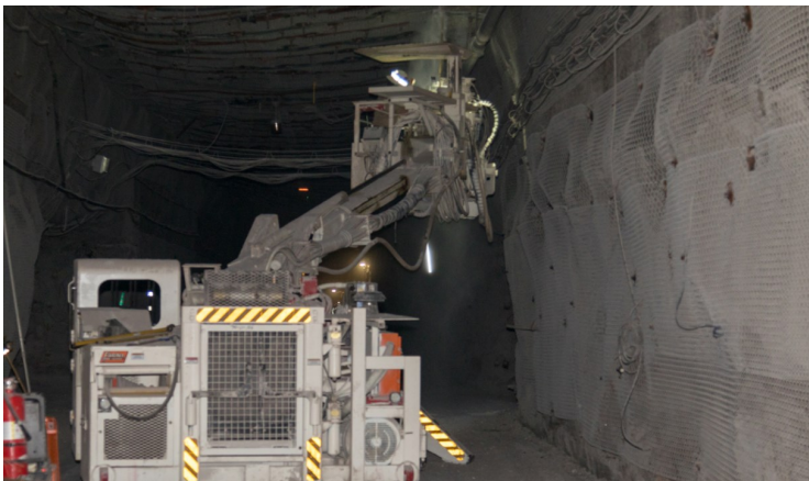
Roof bolts are installed in the underground to secure openings and control salt creep to ensure a safe working environment.