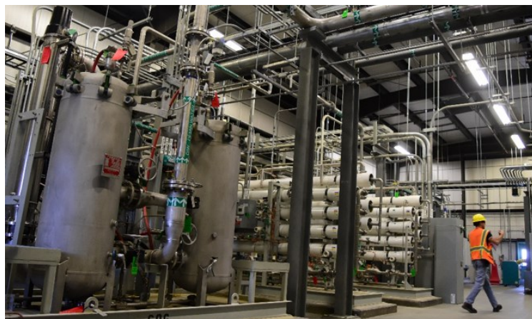
The Water Treatment Building is one of five WTP support facilities that have been handed over for commissioning.