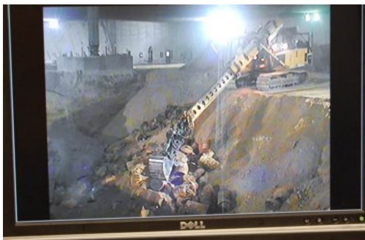
A specially-fitted backhoe exhumes targeted buried waste.