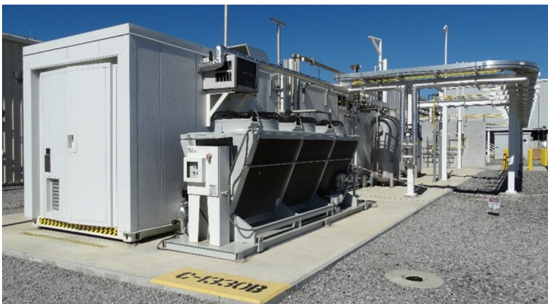
The DUF6 project converted 5,392 metric tons of material during Fiscal Year 2018.