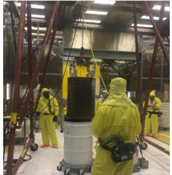
Drum liners containing UNS waste were repackaged prior to treatment.

To further enable waste shipments to WIPP, mobile loading capabilities were stood up at Technical Area 54's Area G several months ahead of schedule. In October a shipment of waste from Area G to WIPP was completed, the first since the disposal facility was reopened.