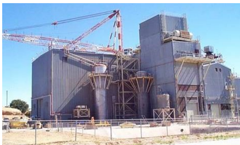
Sodium Pump Test Facility.