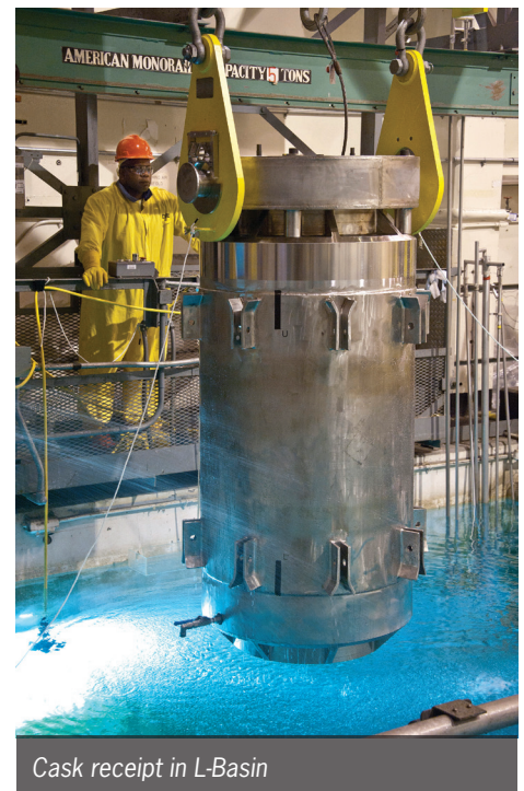
Cask receipt in L-Basin

SFP can receive numerous types of Aluminum-clad SNF assemblies from offsite. These assemblies are shipped to the LAF in various cask types, depending on the geometry of the fuel assemblies. Most cask types are placed directly into the Disassembly Basin prior to unloading to minimize worker exposure. Once in the basin, the fuel is removed from the cask and either directly placed onto carriers or into bundles for long term storage or cropped using an underwater saw to improve storage efficiency prior to being bundled and stored. When ready to be processed, the fuel is removed from storage, placed into a 70-ton cask, and then the cask is removed from the Disassembly Basin and placed on a railcar for onsite transfer to H Canyon.