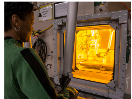
Shielded cell construction allows for safe manipulation of highly radioactive material.

The Savannah River National Laboratory's Shielded Cells Facility provides the ability to safely work with a wide variety of highly radioactive materials in support of nuclear technology development. Skilled operators are able to safely remain outside the cells and use manipulator arms to securely perform complex tasks inside the concealed environment. These manipulator arms are specially designed to handle the most delicate of tasks and endure harsh exposure to high level radiation. The SRNL Shielded Cells Facility includes the largest collection of cells with this type capability in the country.