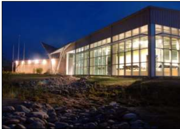
Fernald Preserve Visitor Center