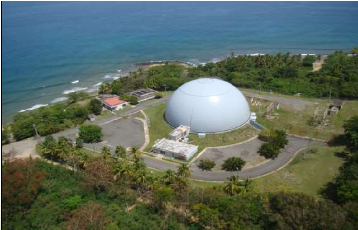
2017 aerial image of the BONUS decommissioned reactor site