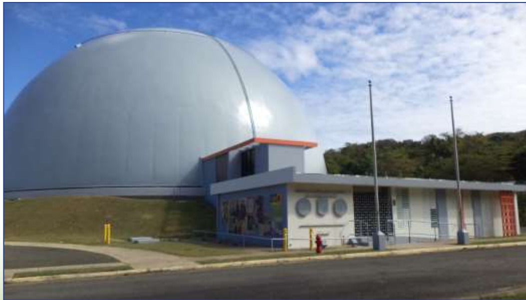
2017 image of the Museum