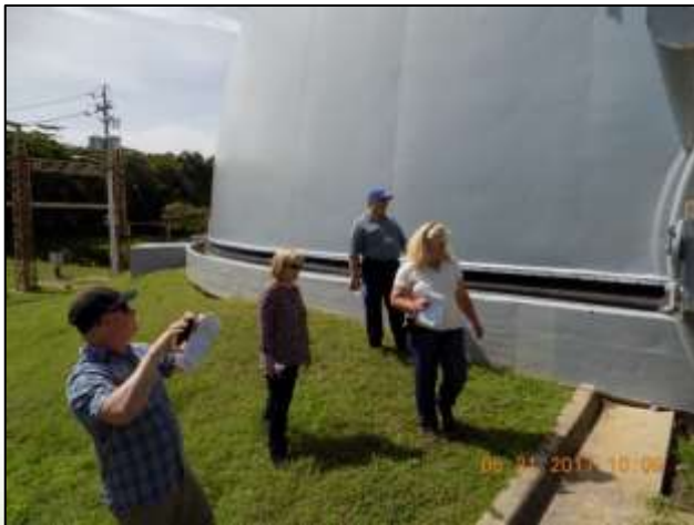
Exterior walk down of the facility.