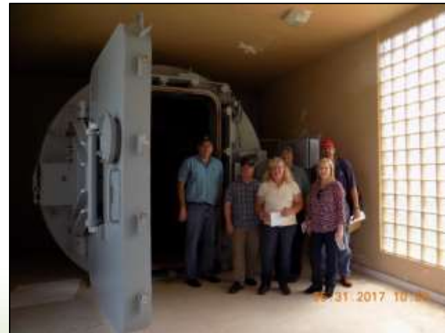
Inspection team entering facility