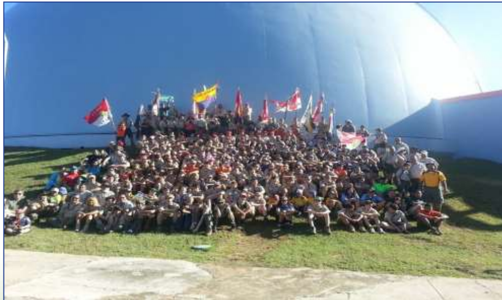
Boy Scouts participated in education outreach hosted by PREPA.