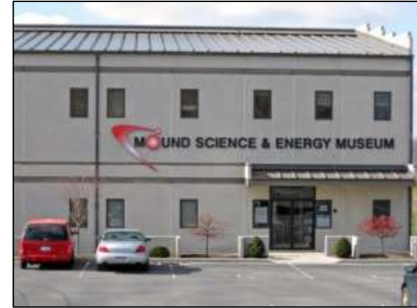
Mound Cold War Discovery Center