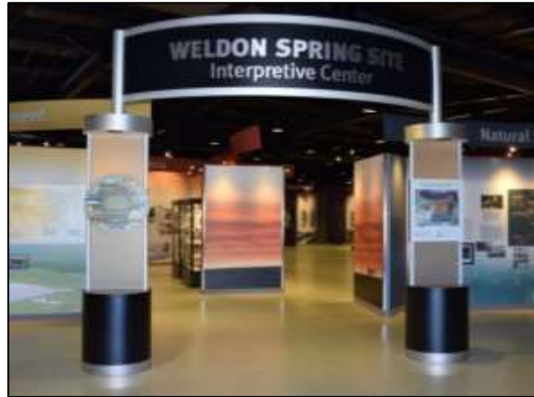
Weldon Spring Interpretive Center