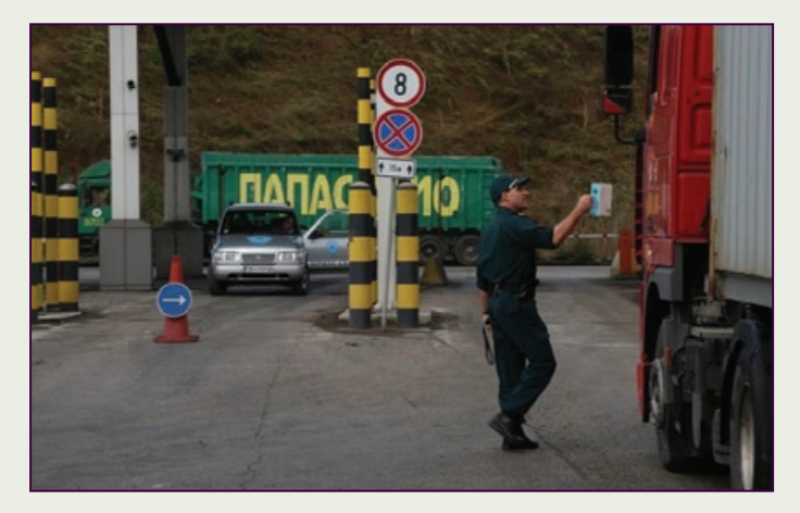
A front-line officer in Bulgaria performs a secondary inspection. When people, vehicles, or cargo pass through detection equipment and generate radiation alarms, well-trained officers use handheld instruments to locate and identify the radiation sources.

NSDD takes a number of approaches to protect its investments in equipment. One approach is to promote the use of regional and local maintenance providers, who are contracted to provide routine maintenance and repair of the equipment. Another approach is to develop this capability within the operating organization's existing information