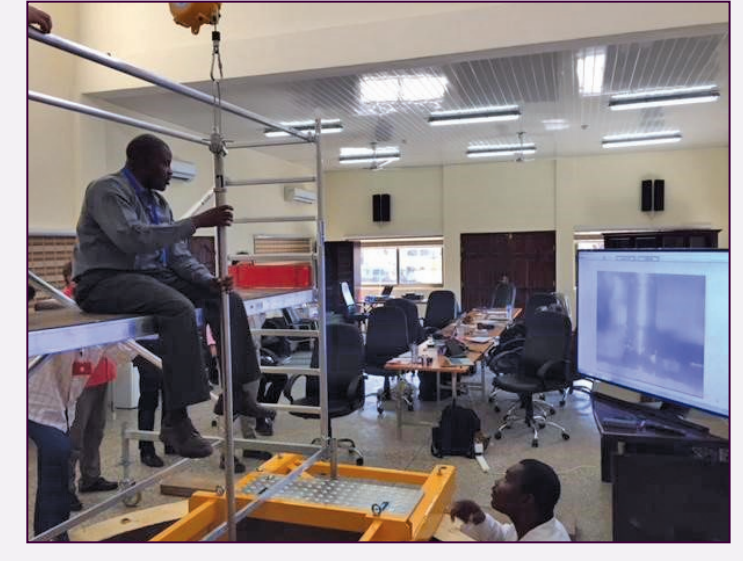
A Nigerian operator in training.

With training for the removal of the Nigerian MNSR core underway, Ghana has demonstrated important leadership to promote global nonproliferation efforts.