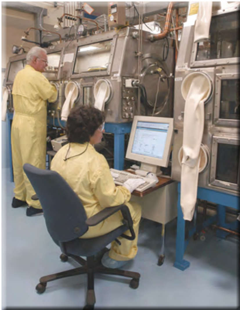
Glovebox Line at TA-55

PF-4 is the only fully operational, full capability plutonium facility in the nation. It supports pit manufacturing, surveillance and special plutonium recovery. To meet the varied needs of research, development and plutonium processing programs at the Laboratory, TA-55 provides chemical and metallurgical processes for recovering, purifying and converting plutonium and other actinides into many compounds and forms. TA-55 houses a sophisticated system for nuclear materials accounting, management and modeling; a measurement support operation; and a nondestructive assay laboratory. Additional capabilities include the means to safely and securely ship, receive, handle and store nuclear materials as well as manage the wastes and residues produced by TA-55 operations. In support of the Surplus Plutonium Disposition Program, PF-4 has developed a process for disassembling pits and producing plutonium oxide that would be used as feed material in the Mixed Oxide Fuel Fabrication Facility under construction at the Savannah River Site.