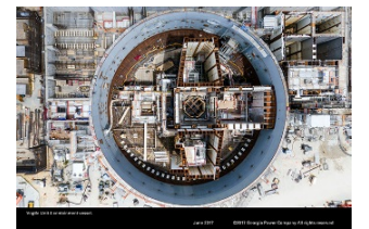
Vogtle Unit 3 Nuclear Island and Turbine Building; Vogtle Unit 4 Containment Vessel (Courtesy of Georgia Power/Southern Company; June 2017)