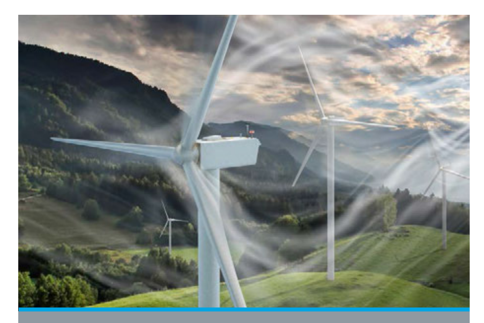
Illustration by NREL depicting the System Management of the Atmospheric Resource by Turbines (SMART) wind plant of the future to better understand how the Earth's atmosphere interacts with wind plants and maximizing energy extraction from the wind. Illustration by Josh Bauer, NREL 31411