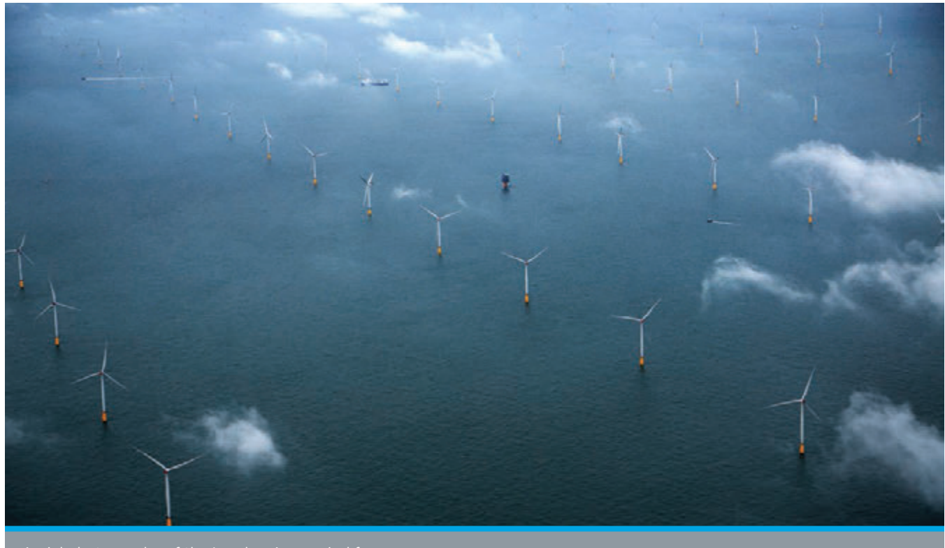
Aerial photography of the London Array wind farm.

information collected under A2e is being placed in the public domain and is accessible through the A2e Data Access Portal. Based on these results, new instruments will be developed to validate wind-plant inflow models and turbine wake interactions. Owner-operators looking to optimize plant production also require advanced flow monitoring integrated into plant level control systems.