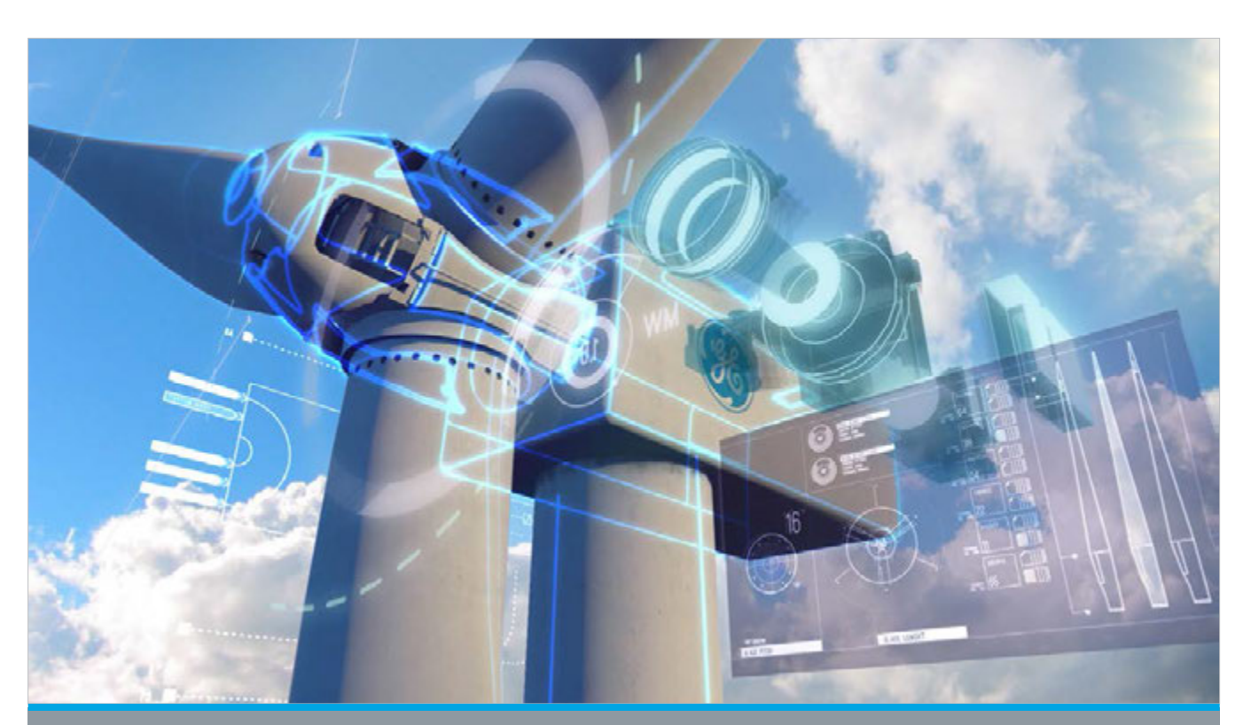
An industry example of a digital Wind Farm illustrating a 2 MW modular turbine individually configured to optimize performance across the wind farm. Illustration by GE Renewable Energy

Attaining future performance goals requires high-fidelity modeling and high-performance computing resources coupled with new state-of-the-art observations to examine and resolve the fundamental physics barriers limiting wind plant cost and performance. Understanding the atmospheric inflow and interaction with large wind farms and facilitating the development of next-generation SMART plant technologies will help achieve future wind penetration levels by lowering LCOE and mitigating technical barriers to wind plant deployment.