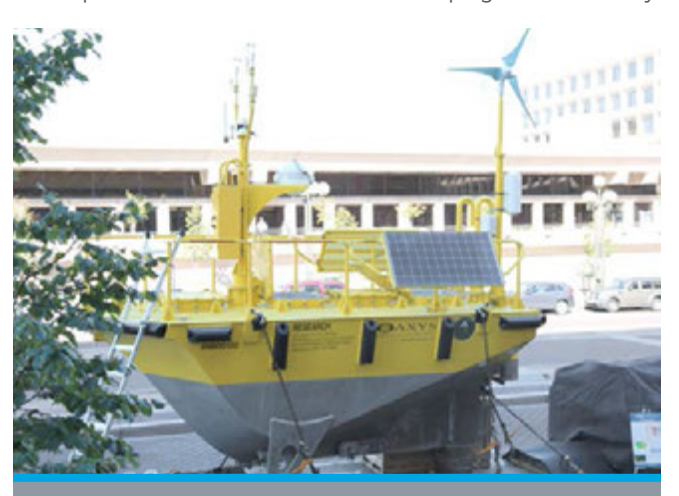
The WindSentinel™ is a floating LiDAR device that accurately measures wind speed and wind direction offshore at turbine hub-height and across the blade span.

Monitoring the behavior of the wind resource is critical to operating the wind plant for maximum energy production and cost performance. Accurately measuring the inflow, both spatially and temporally, is also essential in characterizing the wind resource and providing high-fidelity data for validating inflow prediction models. A field-test campaign conducted by