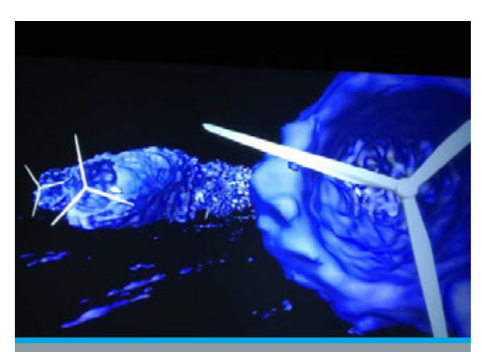
Immersive visualization of low-velocity wakes forming behind the turbines in an LES simulation of the Lilligrund wind farm.

These cumulative effects influence the wind plant optimization and performance potential and must all be taken into consideration. Hence, modeling plant performance requires a detailed knowledge of the atmospheric flow conditions, plant inflow characteristics, plant topography, configuration, and turbine performance characteristics. This is a computational science challenge requiring the most advanced modeling and