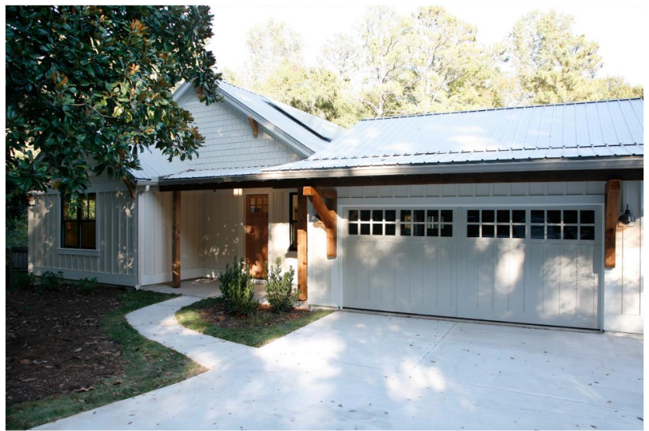
Conditioned SF: 2,100 / Total SF: 2,600 SF Contract Price: $425,000 w/o land