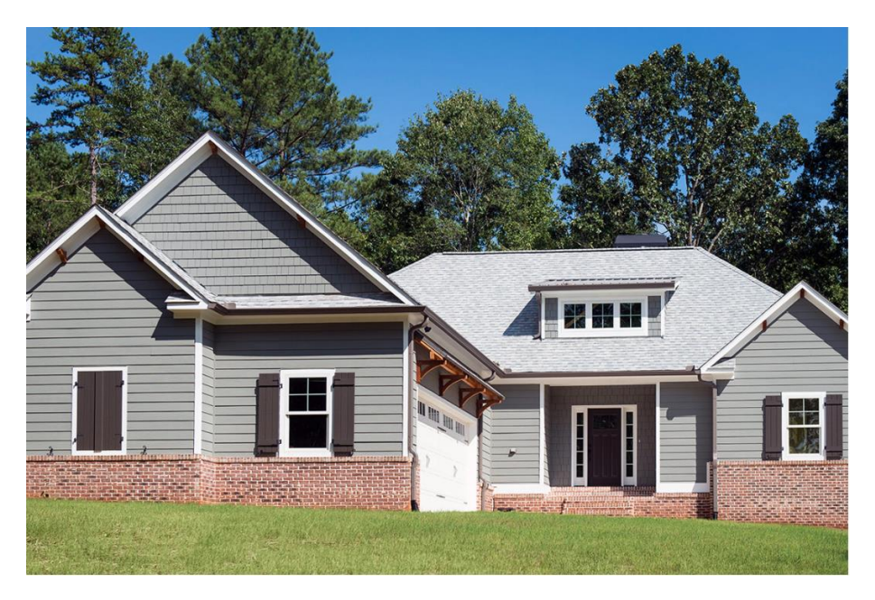
Conditioned SF: 1,950 / Total SF: 2,500 SF Contract Price: $235,000 w/o land