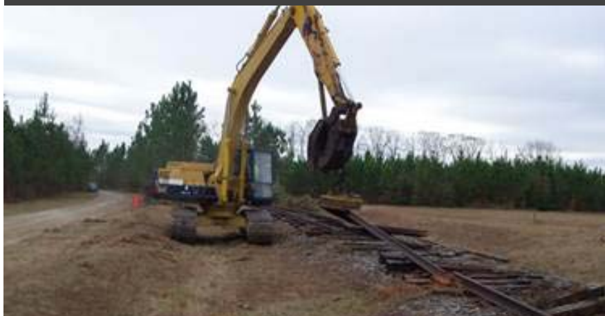
Railroad Track Removal