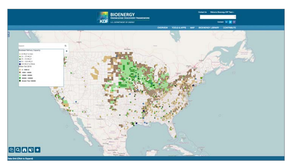
The online Bioenergy KDF interface offers users news and research highlights, search functions, data access, mapping tools, and more.

Developing a sustainable bioenergy industry requires thorough knowledge integration and decision support. The