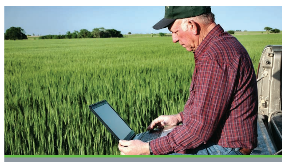
The Bioenergy KDF helps the American public learn about ongoing efforts in Bioenergy technologies.

Making biofuels and bioproducts from domestic, non-food, and waste sources will help to provide benefits that are of strategic importance to the United States, including economic growth, energy security, environmental quality, and technology leadership. A key challenge to achieving these goals is synchronizing all of the steps in the biomass-to-biofuels supply chain—from biomass production