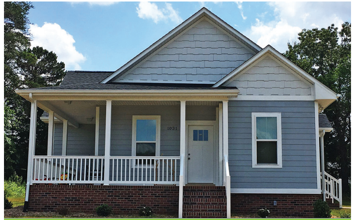
The U.S. Department of Energy's Building America Solution Center conveys the research that turns today's homes into high-performance Zero-Energy Ready homes.

The Sales Tool can also be used to produce a customized full reference document for your sales team with non-jargon descriptions of your building-science measures, the compelling benefits they provide, and sales messages for conversations with consumers.