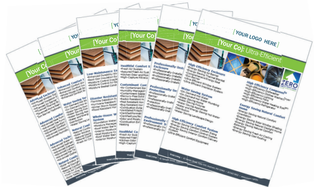
Use the Solution Center to create customized brochures for buyers and training binders for sales staff sporting your company logo and listing your homes' own special features in language everyone can understand.