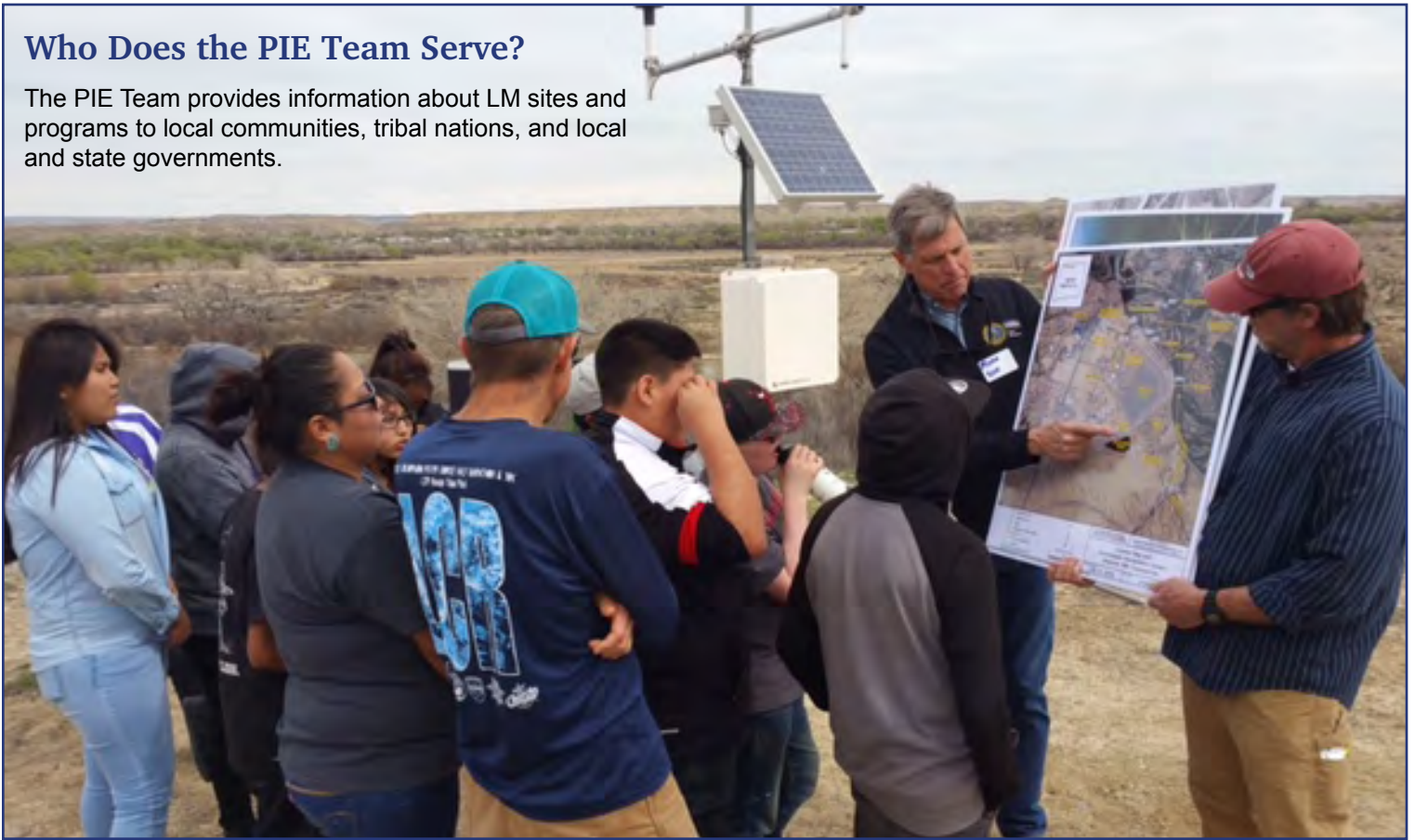
Stakeholders are given a tour of the Shiprock, New Mexico, site.

The PIE Team provides information about LM sites and programs to local communities, tribal nations, and local and state governments.