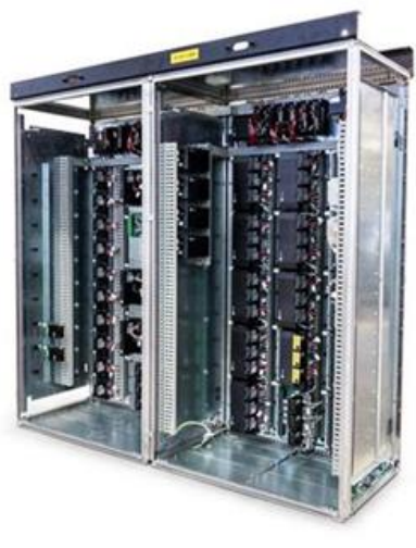
Figure 1: Off-line and Real-Time ADA System and Mark VIe