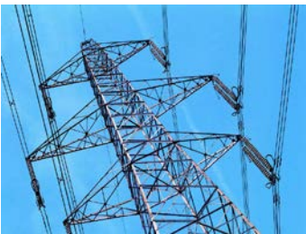
Lowering Finance Rates