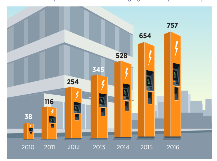
Figure 1. Cumulative number of Challenge partner workplaces with charging stations from 2010 – 2016.