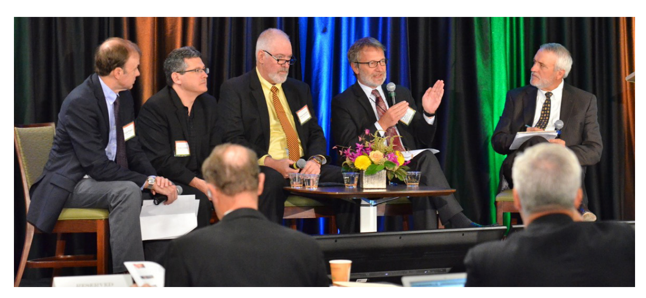
Panelists discuss regional energy needs in renewables, fossil fuels and carbon capture, water, and electric grid and transmission during the North Central/Inter-Mountain West Regional Clean Energy Innovation Summit, hosted by the Colorado Energy Research Collaboratory and held at the University of Colorado, Boulder, on September 19, 2016.

At the Colorado Energy Research Collaboratory event, it was noted that CCUS can play an important role in decarbonization of the energy sector across the Intermountain West region. All the states in the region rely on fossil fuels for both electricity generation and export potential, and Wyoming is the largest coal-producing state in the United States. There are ample opportunities for CO<sub>2</sub> utilization in the region, including CO<sub>2</sub>–EOR in the Bakken fields in North Dakota. Innovation opportunities exist for technologies that can enable CO<sub>2</sub> utilization, affordable advanced carbon capture, and safe and permanent carbon storage.