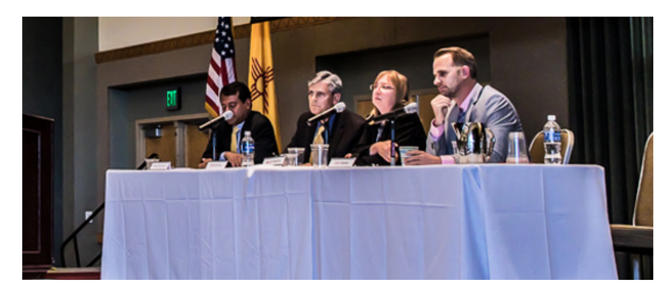
Panelists discuss materials solutions for electrical energy storage at the Southwest Regional Energy Innovation Forum: Materials Technology for Clean Energy, hosted by the University of New Mexico in Albuquerque on July 5, 2016.

• Panelists noted that "one solution is to take the excess renewable energy generated on the grid and produce value-added products such as hydrogen for other uses including biofuels, metal refining and synthesizing ammonia for fertilizer, which renders these industries low carbon dioxide generating, as well." <sup>131</sup>