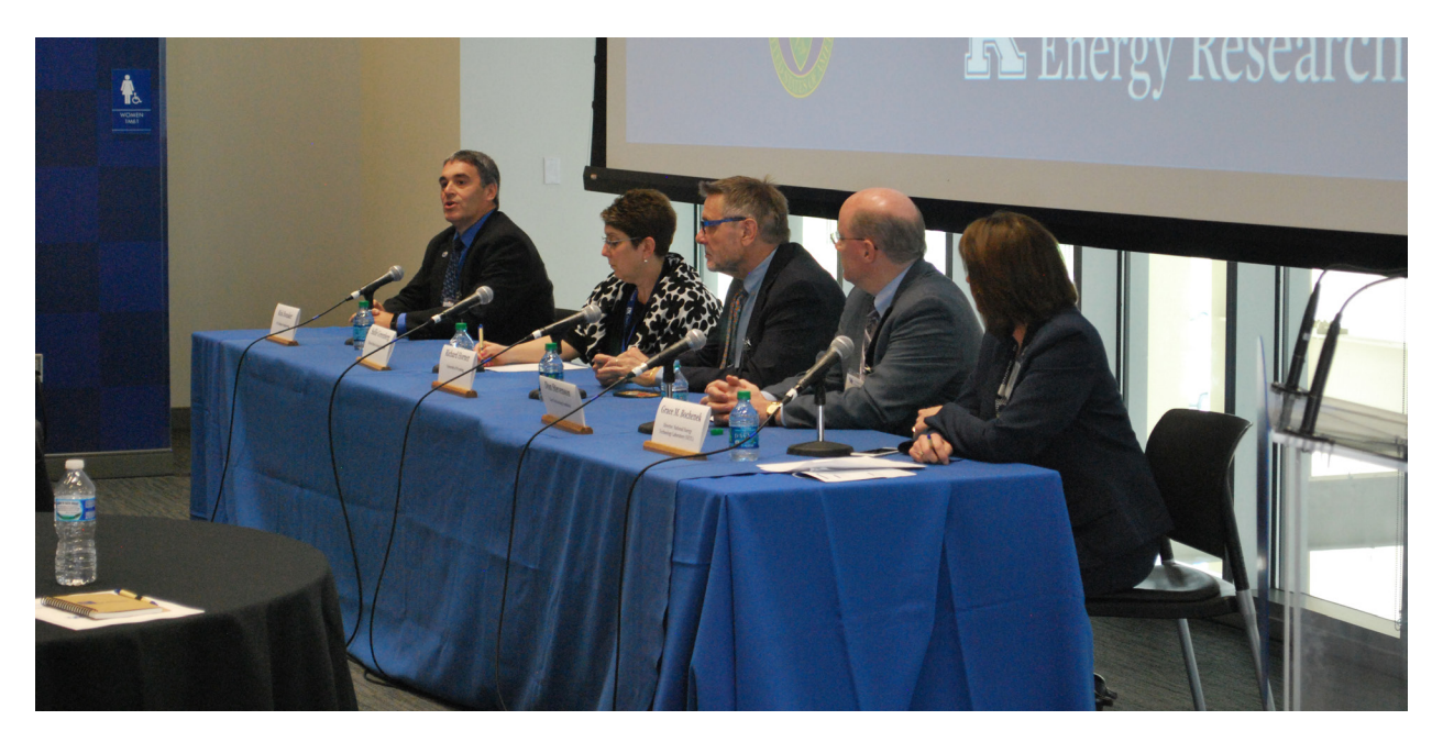
Speakers on the "Innovation, Combustion and CCS Panel" took questions from the audience at the Regional Energy Innovation Forum, hosted by the University of Kentucky in Lexington, Kentucky, on April 21, 2016.

In sum, discussions in multiple forums and workshops indicated that while current technologies can improve the efficiency of buildings, further RD&D can deliver technologies to increase the efficiency of both new and existing buildings. In particular, smart buildings (structures that record, transmit, and optimize their energy