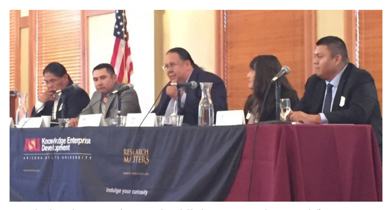
Panelists discuss the importance of American Indian tribal lands to next-generation clean energy and efficient water use as part of the "Water-Energy from the Tribal Perspective" panel at the Southwestern Regional Water-Energy Nexus Event, held at Arizona State University in Tempe, Arizona, on September 8, 2016.

Observations were made at the Arizona State University that "the most significant obstacle to maximizing renewable energy sources is storage. As it currently stands, wind farms must be shut down if we have a surplus of solar energy. Hydroelectric generators go to waste without a method of storing excess power. Power companies, cooperatives, and administrators should not have to take generators offline because there is no way to store the energy."