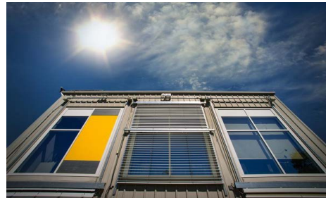
SUCCESS STORY: Energy Efficient Windows Reach Market Quicker with New Tools