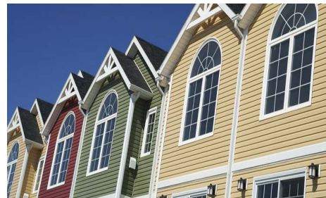
NEW INITIATIVE: Home Improvement Catalyst to Bring Energy Efficiency to More Homes