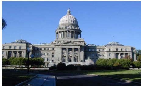
STATES: 6 Pathways for States to Meet Clean Energy Goals

The Building Technologies Digest provides a biweekly roundup of the latest news, funding opportunities, reports, events, and webinars from DOE's Building Technologies Office. Click the links below to learn more.