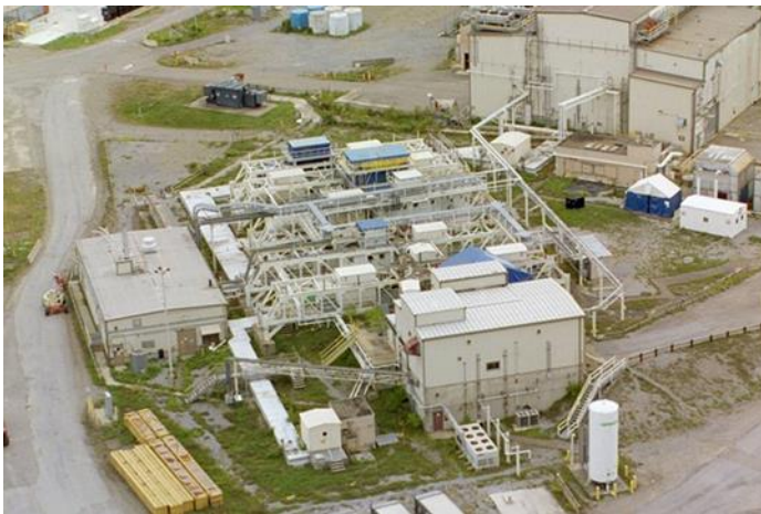
WVDP Waste Tank Farm