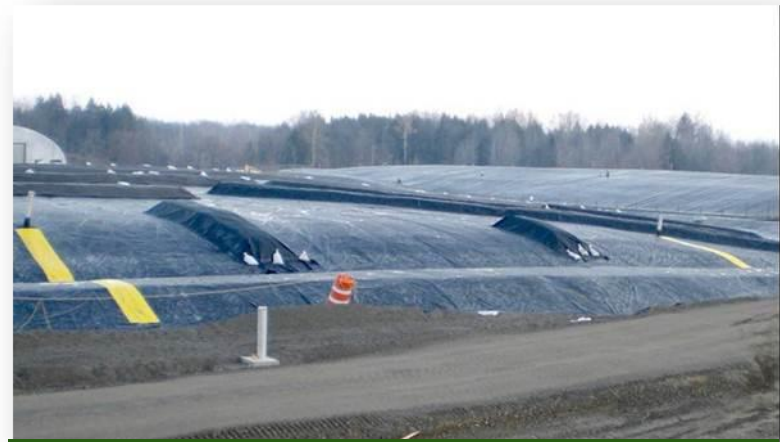
NRC-Licensed Disposal Area