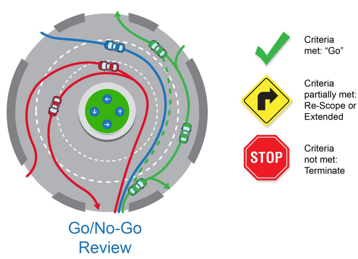
Figure 3-3: Office portfolio management process

Go/no-go reviews, conducted either by BETO staff or external, independent reviewers, provide recommendations to inform go/no-go project decisions. Go/no-go reviews are generally aligned with the budget periods defined in the contractual Assistance Agreement or Annual Operating Plan for each project. Milestones and associated completion criteria are set at the beginning of a budget period or project. Projects are required to present not only progress to date, but also plans for the remainder of the project. At a pre-determined point in the project, progress is evaluated against these review criteria resulting in one of three possible outcomes: (1) review criteria are met resulting in a "go" decision to continue with the project as originally scoped, (2) review criteria are not met resulting in project termination ("no-go"), or (3) review criteria are partially met, resulting in required changes to the project; for example, by changing the scope of the effort or by extending the timeline to completion.