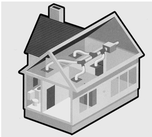
Central exhaust system with multiple duct runs

Another type of continuous whole house exhaust fan is a central fan system with multiple inlets commonly known as “Octopus” systems. These systems are typically placed in a remote area such as an attic and have several duct runs serving different rooms that may require ventilation. They feature quiet operation, effective distribution, and reduce the possibility of pressure imbalances in the home. On the other hand, they are expensive, require balancing, and are labor intensive to install. Therefore, they are generally impractical for weatherization retrofit applications in all but extremely specialized situations.