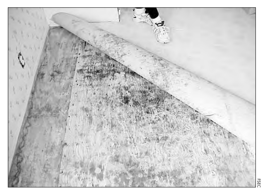
Vinyl flooring in manufactured homes can cause moisture damage, since the low moisture permeability of vinyl can lead to condensation.

be created by the use of exhaust fans. In our inspections, we found only one home (house 4) where the factoryinstalled, occupant-controlled ventilation fan ran continuously—and that home suffered moisture problems. In most manufactured homes the exhaust fan is not operated because of the noise that it creates.