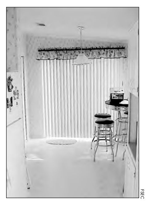
This kitchen has a vinyl floor covering and an overhead supply register. Mold can occur under the vinyl that is washed by cold air from the register.

It is common practice for manufacturers to use vinyl-covered wallboard as the interior finished surface. This is one of the most economical finishes that can be applied and meets the vapor retarder requirement. The Manufactured Housing Institute tested the wallboard with