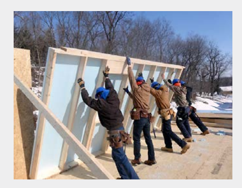
Typical wall section installation

For more Information see the Building America report Advanced Extended Plate and Beam Wall System in a Cold-Climate House at buildingamerica.gov.