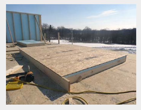
Sheathing over foam wall assembly