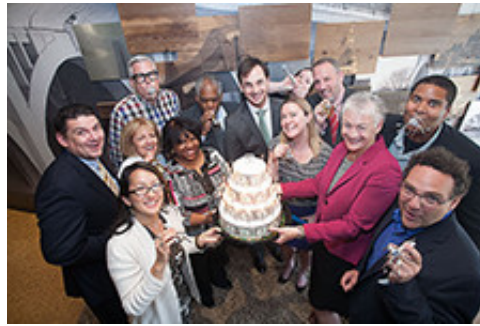
Michigan Saves staff celebrate their $50 million energy investment milestone.

efficiency, from the western tip of the Upper Peninsula to the state's eastern coast of Lake Erie. In June, Michigan Saves celebrated a significant milestone: $50 million in energy investments. The home energy upgrade program, which started in 2009 with grant funding from the Michigan Public Service Commission, makes affordable financing available through partnerships with private-sector lenders. Approximately 5,000 residential and 300 business customers have been served in the past five years.