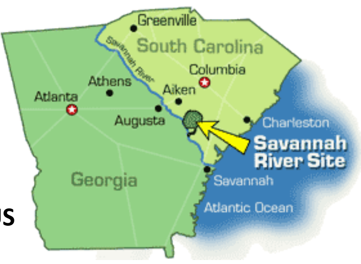
Defense Waste Processing Facility