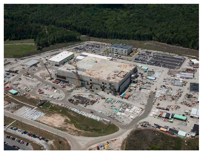
Mixed Oxide Fuel Processing Facility