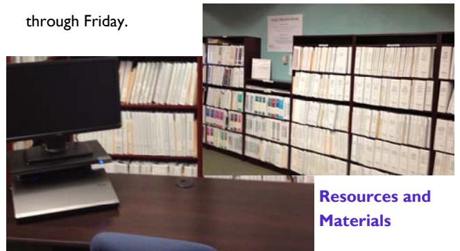
Resources and Materials