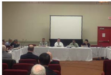
December 4th 2012 Board Meeting at Cities of Gold

The NNM CAB has six bi-monthly meetings annually, each at a different venue in Northern New Mexico. The meetings are open to the public and feature public comment periods, designed to allow the citizens to express their concerns or ask questions of the board and liaison members. Members of the public can