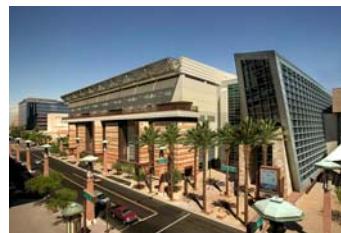
WM Conference held at the Phoenix Convention Center