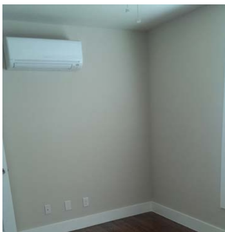
A high-performance ductless heat pump provides all of the home's heating and cooling.