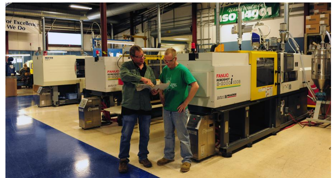
Working toward carbon neutrality, HARBEC, Inc.’s small-scale specialty plastics manufacturing facility in upstate New York implemented an energy management system that earned both ISO 50001 and Platinum Superior Energy Performance certification.

Energy savings achieved at the plant were verified by an accredited third party, earning the facility certification as an SEP Partner at the Platinum level. The plant’s energy resources are now proactively managed via a rigorous business system to sustain those energy savings and continue strengthening plant energy performance in the future.